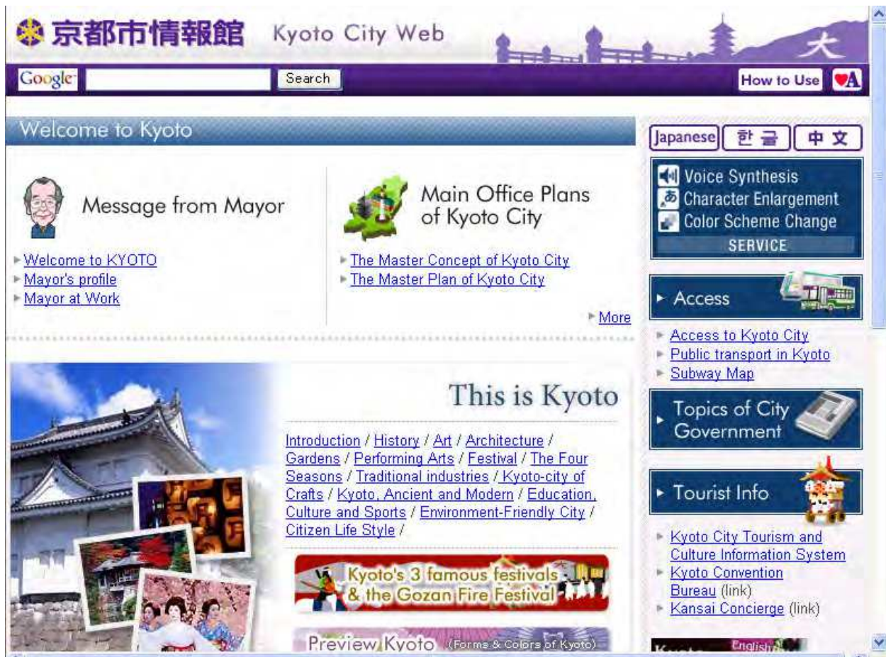
Fig. 1. Kyoto City Web site home

"To attract the world's cultures, Kyoto City created a Web site that allowed all people, regardless of their abilities or native language, to be able to access information. The Web site is available in four languages, and uses IBM Easy Web Browsing technology to enlarge text and read it aloud. The technology is very easy to use and is offered free to the user. Senior citizens, who often have vision difficulties such as low vision or cataracts, can now access all the information on the Kyoto City Web site through enlarged text or as a "screen reader." The screen size can be customized from 50% to 600%. It also enables the user to change the color of the Web site background to help those with color blindness and other color-related vision impairments. For children and non-Kyoto natives, the IBM Easy Web Browsing "reading aloud" function helps increase comprehension. Offering this enhanced communications functionality as part of its Web site increases the user's comfort level with technology – even for novice users."