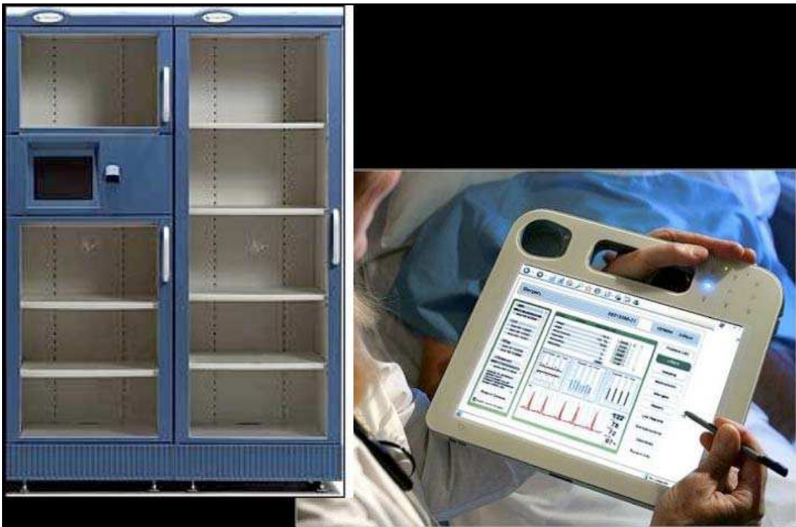
Fig. 1. ad-hoc RFID devices (Smart cabinet and computing platform)

ISO 15693 tag, attached to the bottom of the box or to the plastic bag containing the tissue, then all the items are constantly checked by the readers embedded in the cabinets in which they are located. The cabinets are also equipped with a Low Frequency (125kHz) reader used to control the opening by the operators. The choice of a different operative frequency is mainly justified by the necessity to avoid interferences between the two systems.