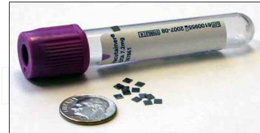
Fig. 2. UWB tags next to a tube for blood samples

Finally few words have to be spent on the Ultra Wide Band systems: passive tags have been developed to track the location of blood specimens in medical laboratories, with transmission frequencies of 5.8GHz and 6.7GHz (Swedberg (c), 2009). Next to good localization performances these devices present extremely low dimensions (around 2mm), making them suitable for a large range of other applications.