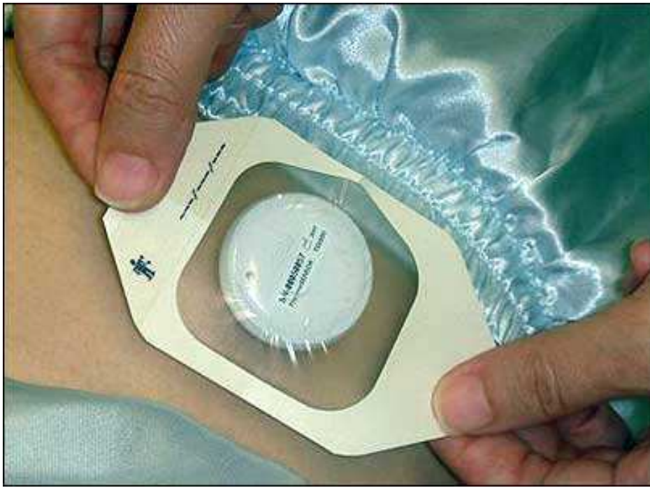
Fig. 7. RFID tag integrating a temperature sensor

movement patterns of patients it is possible to find clues indicating early stages of dementia. The tags used in this system emit radio pulses over multiple bands (from 6GHz to 8GHz) simultaneously. These signals can be transmitted for a much shorter duration of time, improving the reading rate and the final accuracy of the survey.