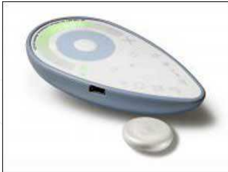
Fig. 6. Tag and Reader of the ovulation prediction system

High Frequency wristbands are used in many applications. The Children Hospital "Vittore Buzzi" in Milano, Italy uses this technology to ensure the right association between mothers, newborn children and their case histories. Both mother and child are provided with a wristband and every time that mother and child meet their identity is checked comparing the identification codes of the tags. The same happens every time that a medicine is administered to the child. Similar applications are also used to ensure the right association between patients and blood sacks and between patient and medication.