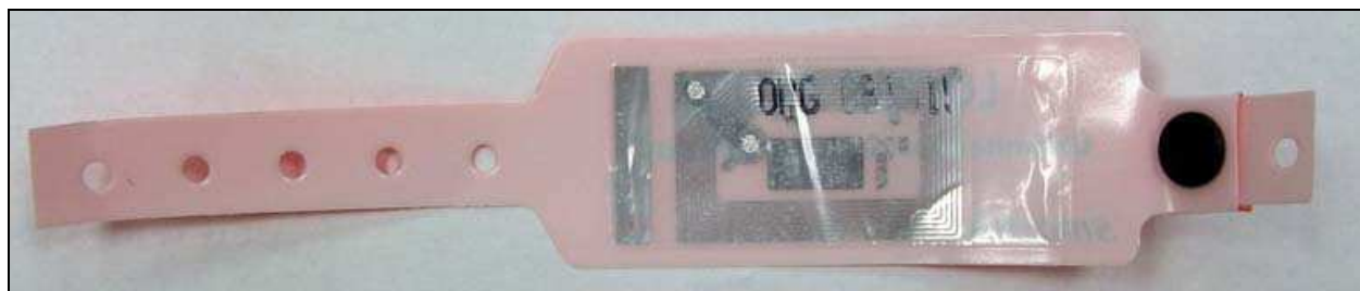
Fig. 5. Passive RFID wristband

Another interesting device especially realized for patient applications and with a vast diffusion is the RFID wristband: this is simply a plastic bracelet with an embedded passive tag (typically of small dimensions) to be read with a handheld reader. Several producers sell these devices and many applications have already been developed worldwide.