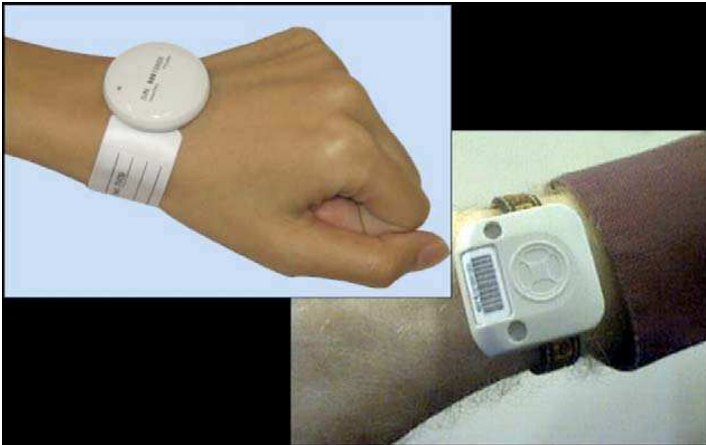
Fig. 8. Active wristbands