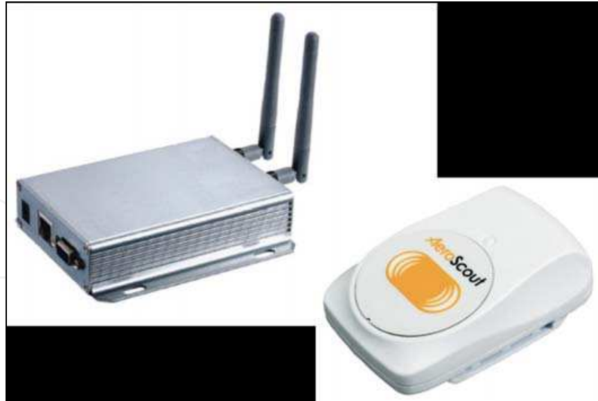
Fig. 3. Wi-Fi RFID reader and tag