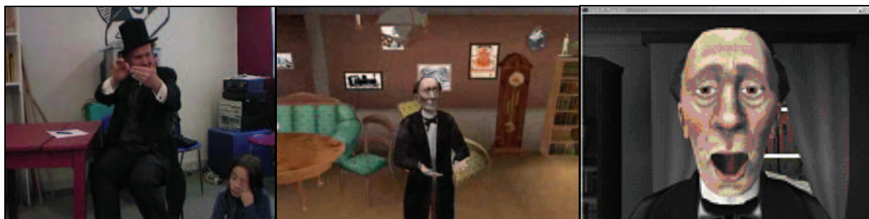
Fig. 3. ( left ) A human actor impersonating HCA interacting with school pupils in the writer's native town of Odense; ( middle ) snapshots of an animation; ( right ) face expressing surprise.