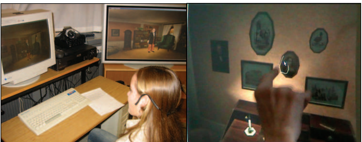
Fig. 4. ( left ) A child interacting with the system; ( right ) hand gesturing on a touch sensitive screen to operate a virtual object within HCA's study.

All pupils were Danish native speakers with advanced skills in speaking English. Fifty-three percent of them (100 percent of males and 43 percent of females) declared themselves as being a frequent (i.e. more than 1 hour/week) videogame and/or console player, with a peak of 45 hours/week spent in gaming by a male teenager. 38.5 percent of the participants (28.6 percent of females and 50 percent of males) had been exposed before to computing systems able to process speech and/or gesture; all of them were acquainted with an earlier version of our system. When asked about their favorite games, children said that they like to play with games of any genre, ranging from shoot-'em-up (66.6 percent of males and 0 percent of females), action, platform, to sports and strategy games (40 percent of males and 50 percent of females). With regard to pre-interaction knowledge about the writer, his life, his fairy tales and the historical period he lived in, 53.8 percent of the children (42.8 percent of females and 66.7 percent of males) declared to have a fair to very good knowledge of these historical and literacy facts and events. Despite surprising at first, this high level of knowledge is due to the fact that Odense is Hans Christian Andersen's hometown. In local schools he is often subject of discussion and several cultural events organized by the Odense municipality are often related to its world-renowned citizen.