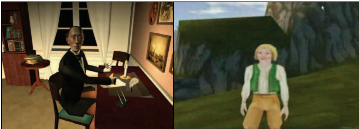
Fig. 1. ( left ) HCA full-body conversational character in his study; ( right ) Cloddy Hans is one of HCA's fairy tale characters that can be encountered in the fairy world.

a 3D graphical world via spoken dialogue as well as pen gestures. Several other characters can be added to the system. However, since we did not create a large enough knowledge base large enough for all characters, they would currently interact the same way as the HCA virtual character does. Typical input gestures are ink markers like lines, points, circles, etc. entered at will via a mouse-compatible input device or using a touch-sensitive screen.