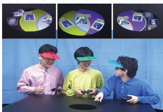
Fig. 3. A goods-barter application