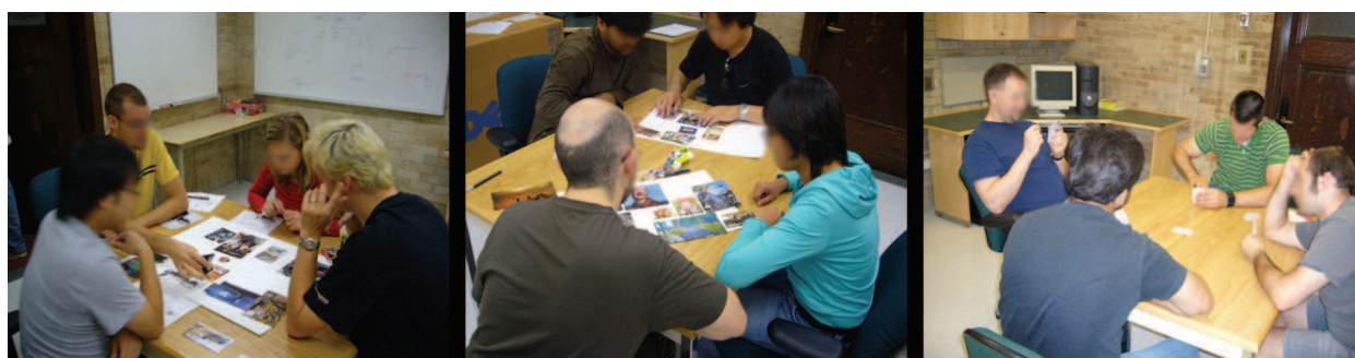
Fig. 4. Building a story in Task 1 (left), building stories in groups in Task 2 (middle), and playing a card game called “Pit” in Task 3 (right).

All sessions were videotaped and analyzed to compare and contrast the sharing of both the tabletop workspace and the objects on the table.