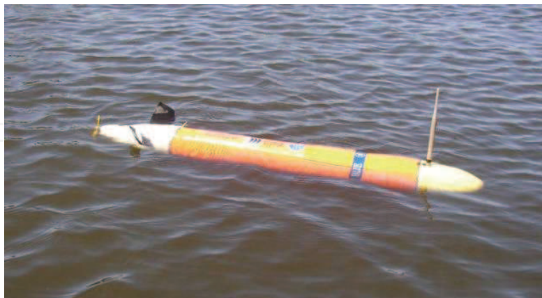
Fig. 1. Light Autonomous Underwater Vehicle (LAUV) designed and built at University of Porto.

The final conclusions are drawn based on our experiments with the Light Autonomous Underwater Vehicle (LAUV) designed and built at University of Porto (see Fig. 1). LAUV is a torpedo shaped vehicle, with a length of 1.1 meters, a diameter of 15 cm and a mass of approximately 18 kg. The actuator system is composed of one propeller and 3 or 4 control fins (depending on the vehicle version), all electrically driven. We compare trajectories logged during the operation of the LAUV with trajectories obtained by simulation of the vehicle's mathematical model.