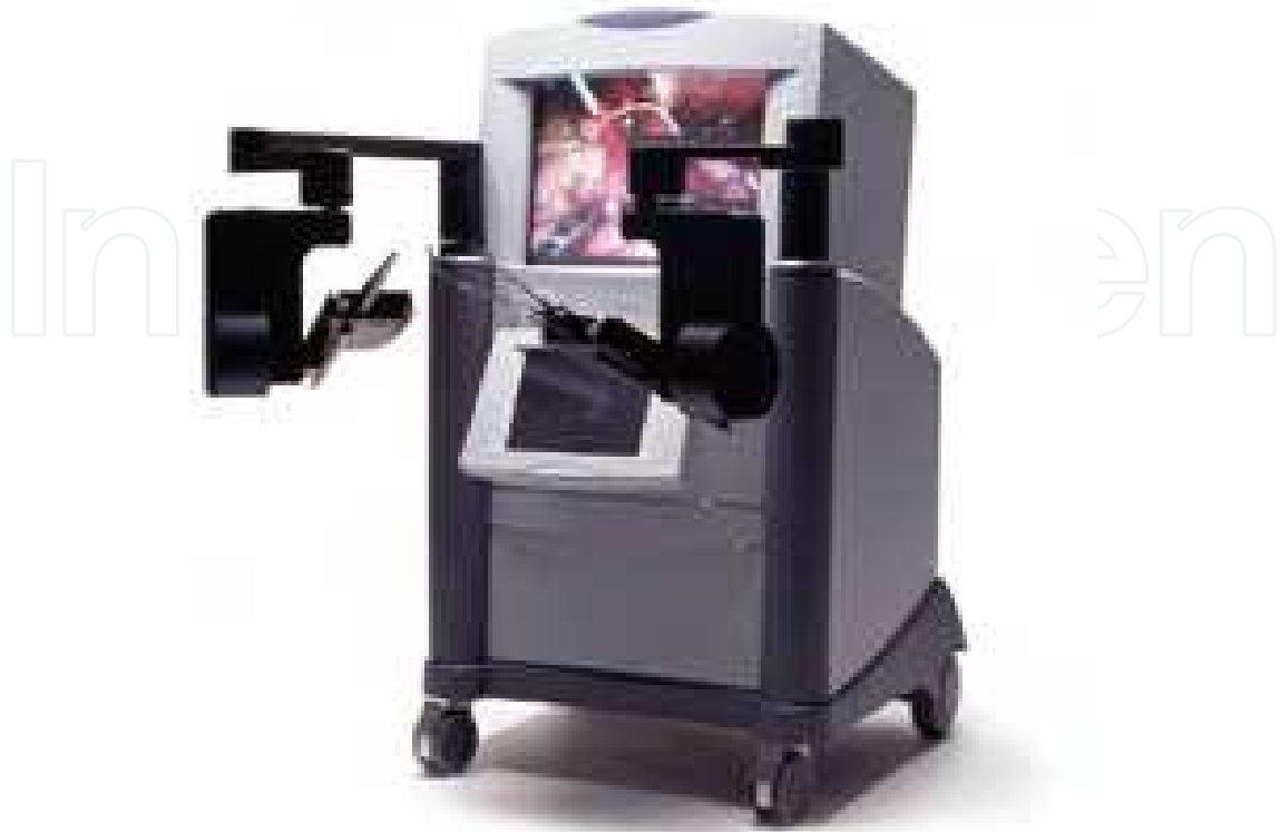
Figure 4. The ZEUS® Surgical System. The camera holder and driver is actually an AESOP derivative which uses AESOP® Endoscope Positioner technology

can be operated either by voice activation or by non verbal command. One of the drawbacks of ZEUS® is its cost which has been estimated at $1,000,000 USD (2007 Cost).