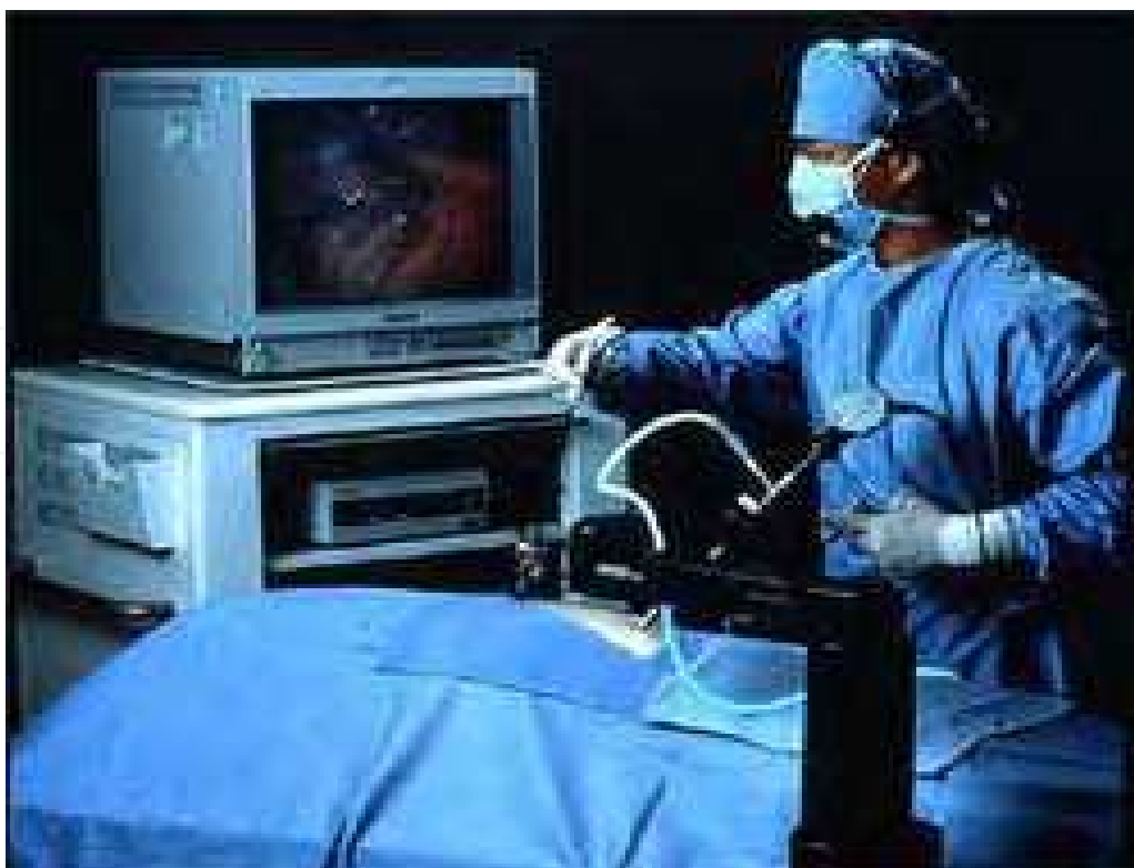
Figure 4. AESOP®.