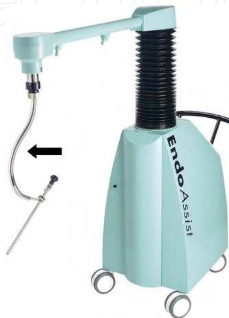
Figure 1. The arrow shows the camera driver of the EndoAssist®.

The EndoAssist® is a novel and unique robotic camera holder (EndoAssist®; Armstrong Healthcare, High Wycombe, Bucks, UK) (Fig. 1). that is controlled by simple head movement by the surgeon and enables complete autonomy over camera movement. Movement is executed by a head-mounted infrared emitter; the sensor is placed above the monitor and picks up any operator executed head movements (Fig. 2). The foot clutch ensures there is no unnecessary travel when movement is not required.