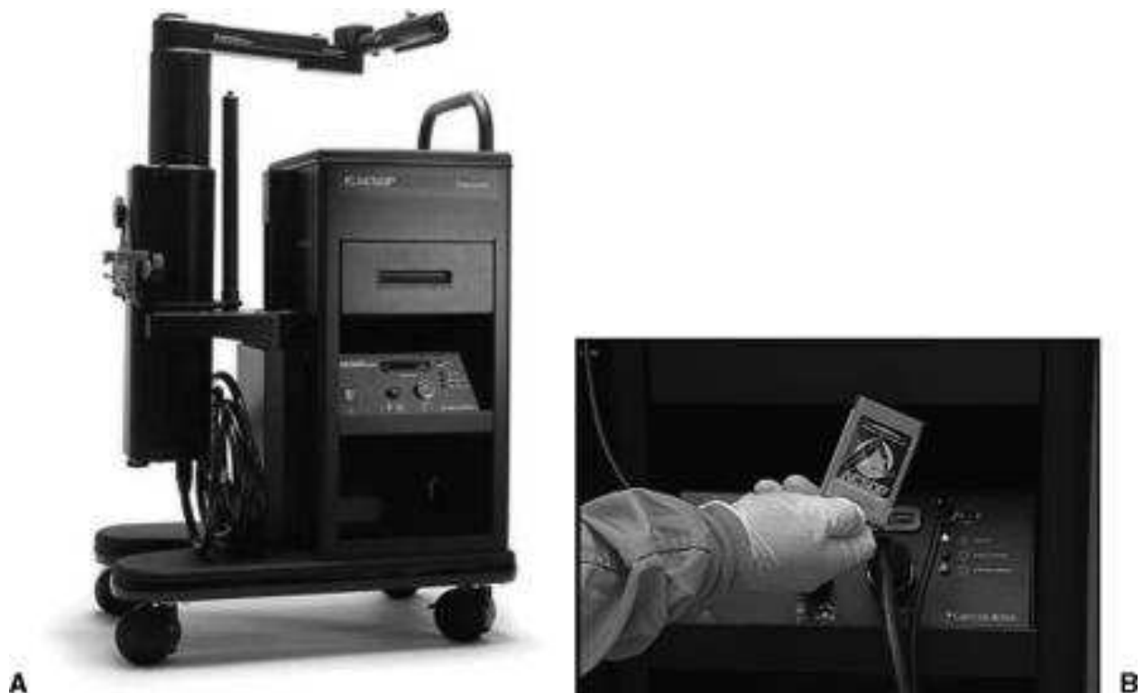
Figure 5. (A) The AESOP® with its camera holding arm (B) The signature voice card.