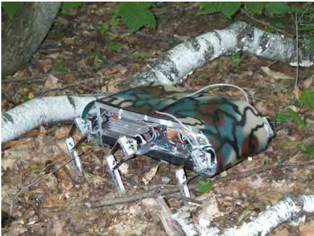
Figure 1. The hexapod robot RHex. Note that although the configuration of the body and the legs does not emulate its model organism, a cockroach, its biomechanics does incorporate the swing inverted pendulum mechanical motion that cockroaches and other insects use.

How do legged robots perform compared to their living counterparts? This question is not as easy to answer as one might hope since many published descriptions of such robots do not include the relevant data. It is obvious from a recent compilation of performance by Saranli et al. (2001), however, that they do not do so well by comparison. Saranli et al. (2001) give dimensions and speed performances of several walking robots, whose speeds range from about 0.02 to 1.1 meters/sec (from 0.006 to 2.5 body lengths/sec). To date, the two fastest types of legged robot seem to be robots of the Sprawl series and RHex (Figure 1). The Sprawl robots, hexapods based on the biomechanics of cockroaches, have been specifically designed to include compliant features in their six legs (Bailey et al., 2001; Cham et al., 2002; Dordevic et al., 2005; Kim et al., 2006). Recent versions can move at about 2.3 m/sec. (about 15 body lengths/sec.) even over uneven terrain (Clark & Cutkosky, 2006).