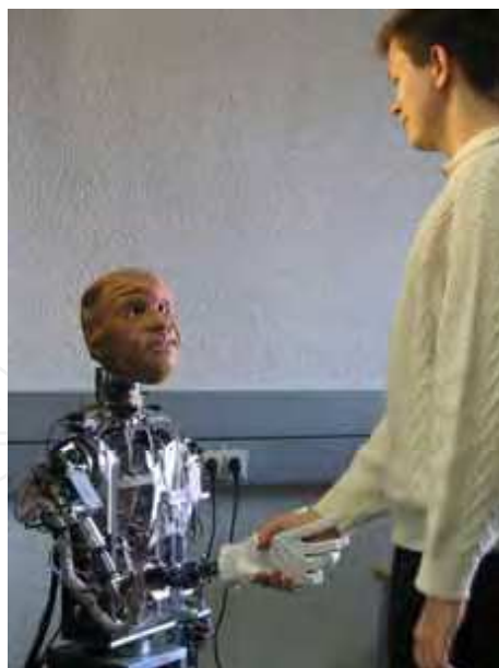
Figure 5. Scenario: Interacting with Barthoc in a human-like manner

The decision to which person Barthoc currently pays attention is taken by current user behaviour as observed by the robot. The system is capable of classifying whether someone is standing still or passing by, it can recognize the current gaze of a person by the face detector and the Voice Anchor provides the information whether a person is speaking. Assuming that people look at the communication partner they are talking to the following hierarchy was implemented: Of the lowest interest are people passing by independently of the remaining information. Persons who are looking at the robot are more interesting than persons looking away. Taking into account that the robot might not see all people as they are out of its field of view a detected voice raises the interest. The most interest is paid to a person who is standing in front of, talking towards and facing the robot. It is assumed that this person wants to start an interaction and the robot will not pay attention to another person as long as these three conditions are fulfilled. Given more than one Person on the same interest level the robot's attention will skip from one person to the next one after an adjustable time span, which is currently four to six seconds. The order for the changes is determined by the order in which the people were first recognized by Barthoc.