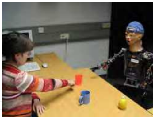
Figure 1. Imitation of deictic gestures for referencing on the same object

Many classical approaches developed so far for learning in a human-robot interaction setting have focussed on rather low level motor learning by imitation. Some doubts, however, have been casted on whether with this approach higher level functioning will be achieved (Gergeley, 2003). Higher level processes include, for example, the cognitive capability to assign meaning to actions in order to learn from the tutor. Such capabilities involve that an agent not only needs to be able to mimic the motoric movement of the action performed by the tutor. Rather, it understands the constraints, the means, and the goal(s) of an action in the course of its learning process. Further support for this hypothesis comes from parent-infant instructions where it has been observed that parents are very sensitive and adaptive tutors who modify their behaviour to the cognitive needs of their infant (Brand et al., 2002).