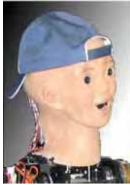
Figure 2. Child-sized Barthoc Junior

two serial connections to a desktop computer, and a motor for rotations around its main axis. One interface is used for controlling head and neck actuators, while the second one is connected to all components below the neck. The torso of the robot consists of a metal frame with a transparent cover to protect the inner elements. Within the torso all necessary electronics for movement are integrated. In total 41 actuators consisting of DC- and servo motors are used to control the robot. To achieve human-like facial expressions ten degrees of freedom are used in its face to control jaw, mouth angles, eyes, eyebrows and eyelids. The eyes are vertically aligned and horizontally controllable autonomously for object fixations. Each eye contains one FireWire colour video camera with a resolution of 640x480 pixels.