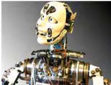
Figure 3. Adult-sized Barthoc

Besides facial expressions and eye movements the head can be turned, tilted to its side and slightly shifted forwards and backwards. The set of human-like motion capabilities is completed by two arms, mounted at the sides of the robot. With the help of two five finger hands both deictic gestures and simple grips are realizable. The fingers of each hand have only one bending actuator but are controllable autonomously and made of synthetic material to achieve minimal weight. Besides the neck two shoulder elements are added that can be lifted to simulate shrugging of the shoulders. For speech understanding and the detection of multiple speaker directions two microphones are used, one fixed on each shoulder element. This is a temporary solution. The microphones will be fixed at the ear positions as soon as an improved noise reduction for the head servos is available.