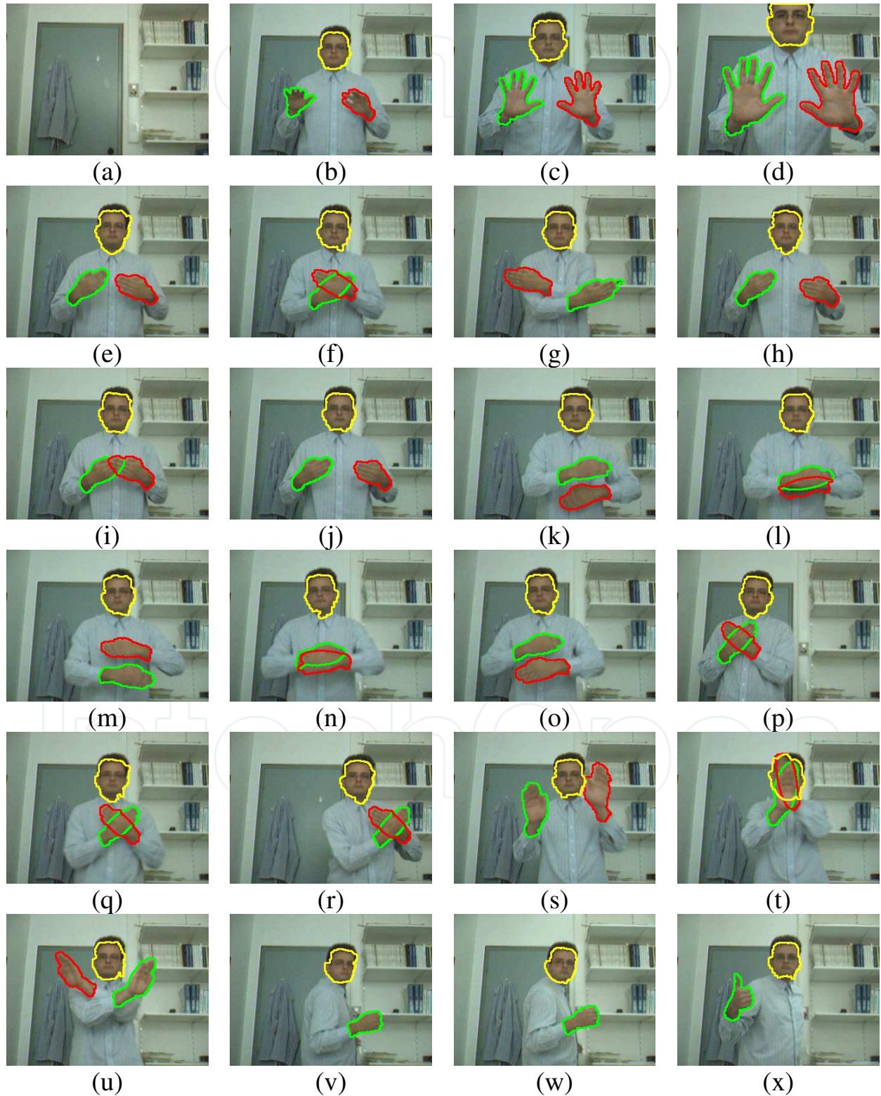
Figure 2. Characteristic snapshots from the on-line tracking experiment

Later on, the person starts applauding which results in his hands touching but not crossing each other ((h)-(j)). Right after, the person starts crossing his hands like tying in knots ((k)-(o)). Next, the hands cross each other and stay like this for a considerable amount of time; then the person starts moving, still keeping his hands crossed ((p)-(r)). Then, the person waves and crosses his hands in front of his face ((s)-(u)). The experiment concludes with the person turning the light on and off ((v)-(x)), while greeting towards the camera (Fig. 2(x)).