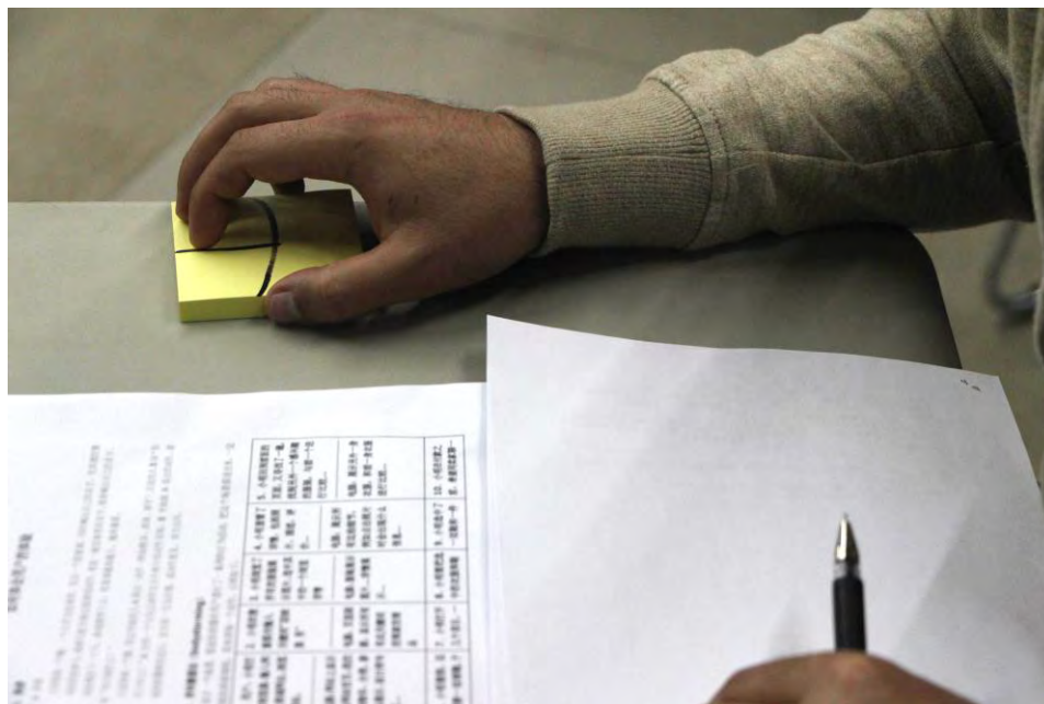
Figure 2: Startup participant takes post-it as a mouse during body storming