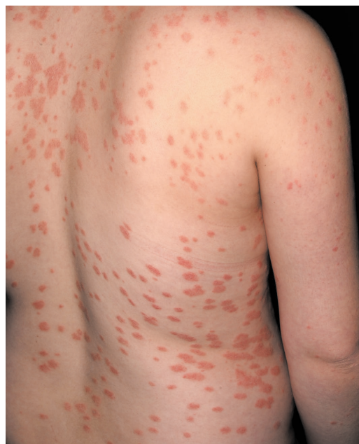
Figure 2 Guttate psoriasis. Disseminated grayish-red papules and plaques with firmly adhering scales, measuring up to 1 cm in size.

A comprehensive diagnostic workup should always include the search for possible triggers, streptococcal infections in particular [12]. Roughly 60 % of all pediatric cases are triggered by streptococcal infections, especially of the tonsils and perianal region. Molecular mimicry between streptococcal antigens and