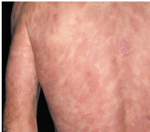
Figure 5 Mycosis fungoides. Multiple, partially confluent, scaly, erythematous patches and plaques.

classic arrangement of MF lesions along the cleavage lines is observed in stage 1 and 2 disease in particular (Figure 5), with well-demarcated erythematous macules and plaques that primarily affect the trunk and the flexor aspects of the extremities. The clinical picture ranges from homogeneous, erythematous scaly plaques to a poikilodermatous appearance with white, red and brown components within the same lesion [15].