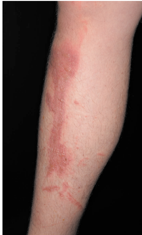
Figure 11 Phototoxic dermatitis. Serpiginous erythema with blistering after exposure to giant hogweed ( Heracleum giganteum ).