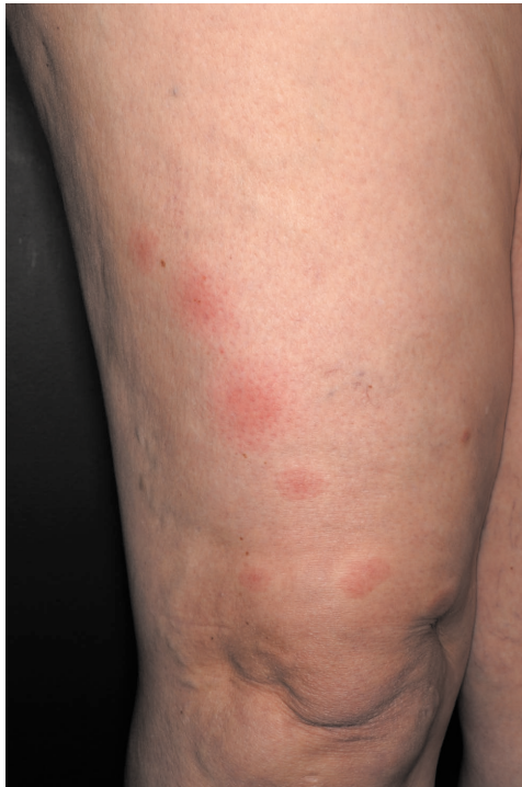
Figure 14 Grouped, light-red papules with an urticarial appearance (and a central bite site) arranged in a linear manner in a patient bitten by bedbug.

Urticarial papules arranged in a linear fashion are suspicious for bedbug bites.