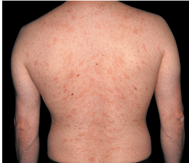
Figure 3 Pityriasis rosea. Salmon-colored, oval macules with collarette-like scales following the Langer lines.

keratinocyte antigens is thought to be responsible [13]. In the early stages, it may be difficult to differentiate guttate psoriasis from pityriasis rosea or stage 2 syphilis, as the characteristic morphology of individual lesions may not yet be discernible.