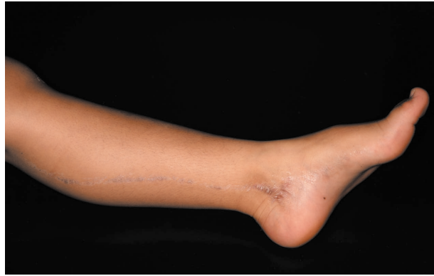
Figure 7 Lichen striatus. Small red-brownish, lichenoid, flat papules coalescing to a streak along the lines of Blaschko.

involvement may be associated with nonsegmental, bilateral lesions of the same disorder and has therefore been referred to as “superimposed segmental manifestation of polygenic skin disorders” [37].