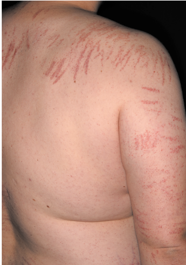
Figure 13 Sharply demarcated erythematous streaks in a patient with flagellate dermatitis.

Paraphenylenediamine is a highly potent contact allergen in temptoos and may cause contact dermatitis with a linear pattern.