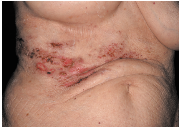
Figure 6 Herpes zoster (T6/7). Grouped vesicles on an erythematous base with signs of impetiginization.

frequently experience prodromal symptoms for a few days, such as a tingling or burning sensation and, in some cases, even lancinating pain.