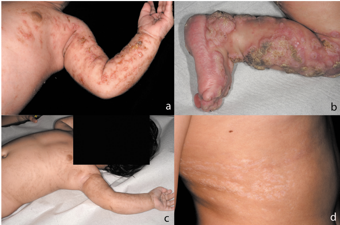
Figure 10 Incontinentia pigmenti. Inflammatory stage characterized by grouped blisters and erosions arranged in a serpiginous pattern (a). Verrucous stage showing hyperkeratotic papules and nodules with a verrucous surface arranged in a serpiginous pattern along the lines of Blaschko (b). Hyperpigmented stage. Hyperpigmentation along the lines of Blaschko (c). Hypopigmented stage. Hypopigmentation along the lines of Blaschko (d).

Phacomatosis pigmentokeratotica describes the concurrence of nevus spilus and nevus sebaceus.