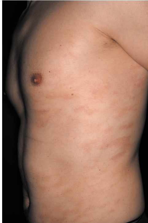
Figure 4 Parapsoriasis. Light-red and brown-yellowish digitiform patches and plaques following the Langer lines.

classic arrangement of MF lesions along the cleavage lines is observed in stage 1 and 2 disease in particular (Figure 5), with well-demarcated erythematous macules and plaques that primarily affect the trunk and the flexor aspects of the extremities. The clinical picture ranges from homogeneous, erythematous scaly plaques to a poikilodermatous appearance with white, red and brown components within the same lesion [15].