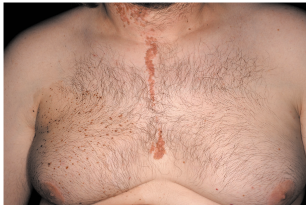
Figure 9 Phacomatosis pigmentokeratolica. Brownish-reddish papules and nodules with a verrucous surface. The lesions coalesce to form a linear plaque (nevus sebaceus). In addition, there is a light-brown patch with dark-brown specks (nevus spilus).

spilosebacea' (Figure 9). CNS involvement, including epilepsy and deafness, is possible [42]. The syndrome is caused by a postzygotic activating mutation in the RAS signaling pathway of a multipotent ectodermal progenitor cell; however, there is no germline mutation. Similar to patients with non-syndromic nevus sebaceus, individuals with phacomatosis pigmentokeratolica may likewise develop various