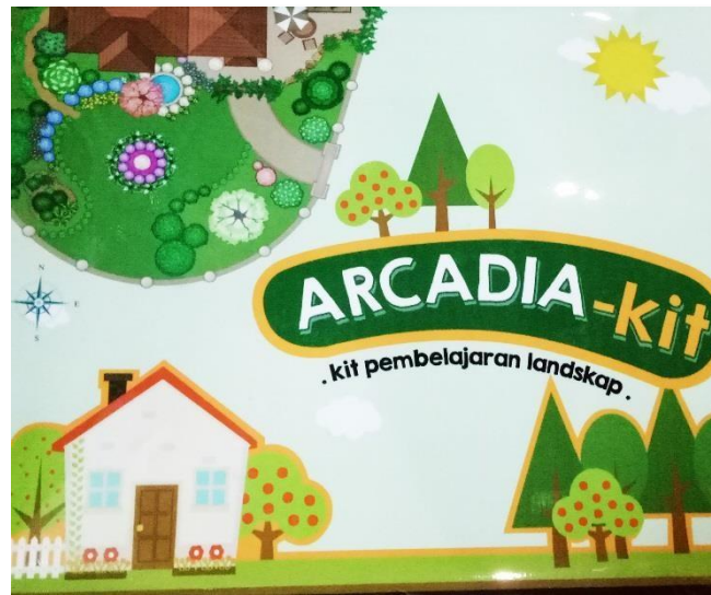
Figure 3: The ARCADIA-Kit

The ARCADIA-Kit consists of a variety of magnetic cut-out shapes of landscape so the materials can stick to the white board when teaching (Figure 4). This will produce an ideal teaching setting as teachers can do the composition of the landscape layout using the whiteboard. The size of the materials can be increased or reduced according to the setting of the classroom. The magnetic board can be separated and this will allow the students to sit in groups and practiced their knowledge during the hands-on activity.