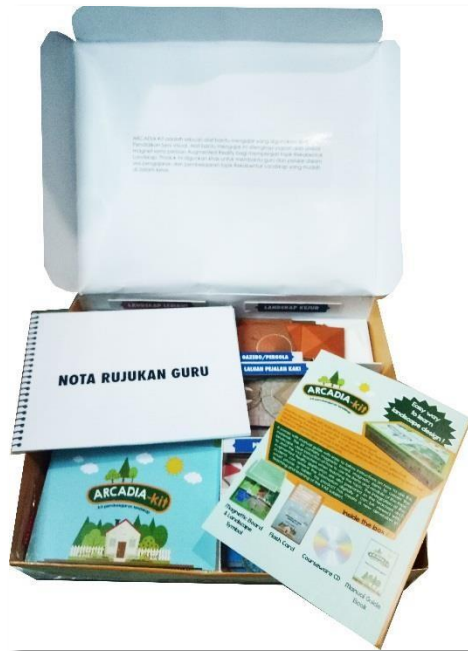
Figure 1: Items in the ARCDIA-Kit

a module to assist VAE teachers when teaching the topic (Figure 1). The kit also allows teachers and students to retrieve information digitally based on the Augmented Reality application that incorporates digital materials to fulfil the needs of the 21 st Century learning (Figure 2). Specifically, the kit can be viewed with a smart phone or tablet. This is to change how teachers and students can interact with technology to enhance the teaching and learning process. To ensure the acceptance and success of future AR system, it is vital to understand the end users' experience and requirements (Sha Liang, 2015).