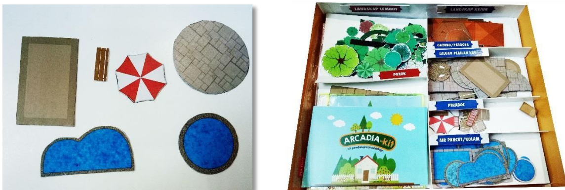
Figure 4: The magnetic items provided in the ARCADIA-Kit