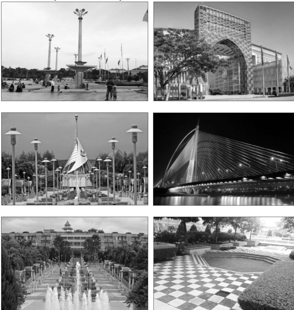
Figure 3: Examples of the urban landscape in Putrajaya, integrated with a variety of public arts in the forms of monument, land art, and street furniture