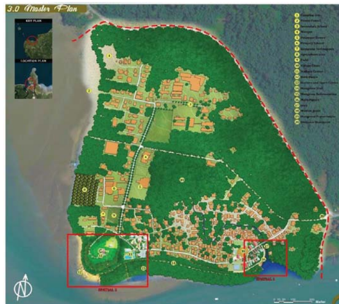
Figure 1: Proposed Master Plan for Kampung Santubong