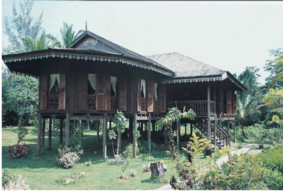
Figure 2 Example of The Malay timber houses of Kelantan (Source: Zumahiran and Ismail Said 2010).