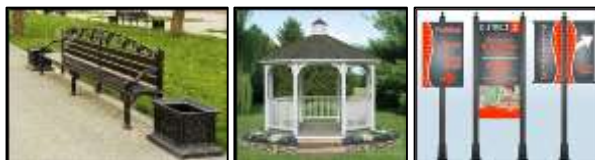
Figure 4: Examples of street furniture in public space

Based on the questionnaire survey through quantitative analysis, half of the respondents expressed the lack of natural features at the study area. In addition, it was found the shoddy landscaping works is unsafe for children to use the space. Table 2 above shows the findings that reveals the less functioning of public space facilities due to lack of natural features such as bicycle trail and pedestrian walkway interconnected with the air quality and climate of the urban environment. This is supported by Ja'afar et al. (2013) stated that the physical planning not only based on the soft landscape feature at public space, but encompassed the hard landscape features and street furnitures such as bicycle racks, signage, lighting and benches. Following this, Zendehtelan, Pouyanfar and Ahmad (2013) pointed out the design quality of landscaping at public space should emphasize the space environment, roads circulation, entrances in order to create sense of place and to form continuity in public space. In other words, the landscape elements can portray the identity of study area in GTWHS.