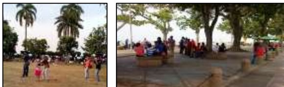
Figure 3: Users with their activities in Padang Kota Lama

walkway, food court, basketball court and benches. Figure 3 shows the activities at the urban park which also serve as a venue for celebrations, events, urban activities and cultural festivals such as Penang Bon Odori Festival.