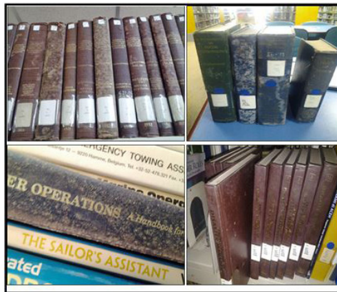
Figure 4: Mould Growth on the Binder Books in the Libraries

From the visual inspection of the three case studies, it found that some of the books on the book rack especially at crawls area are identifying with mould symptom on the book cover such fuzzy spot or powdery. This condition due to the area of crawling spaces got less of light, exposed to dust and humid. The relative humidity condition at 61% to 80% was one of the factors that contributed to the humid in the ambient and therefore mould growth at a certain area in this three libraries. It also due to the books immobile or recess at the same place and didn't get decent airflow. The mould growth on the books cover is shown in figure 4 below.