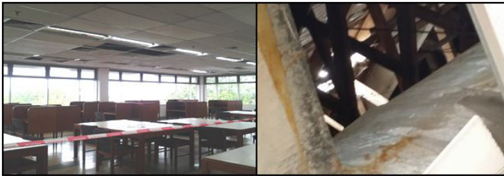
Figure 1: Leaking Roof Cause Ceiling Damage, Moisture and Mould Growth at Level 5 of Library C

diffusers, ceiling and carpet. One of the main causes of the existence of water that contribute to mould growth within the library buildings. The results of both libraries such as Library B and C show the similar problem of severe moisture penetrate into the building. They had experienced on roof system failure, therefore, the upper floor presence mould at many places especially on the ceiling and a few places on the wall and floor. The most interesting finding was the collapse of the ceiling at level 5 of Library C and the water rindrop at those level during visual inspection as shown in Figure 1.