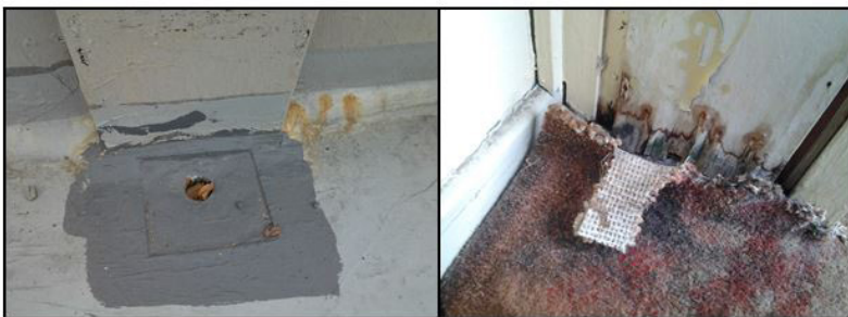
Figure 3: Roof and RWDP Failure Cause Timber Column Damage, Moisture and Mould Growth at Library

Library B had an experience of the failure of rainwater downpipe and flat roof system. The improper maintenance work such as clear out the dry leaves and debris slow the rainwater get through the pipe. The dry leaves and debris in the area of flat roof gutter is not been cleared and start to block the drain especially during heavy rain. These should be cleared out during a regular maintenance schedule. Therefore the water intrusion from the rainwater downpipe (RWDP) in the timber column contributed moisture inside this library as shown in Figure 3 below.