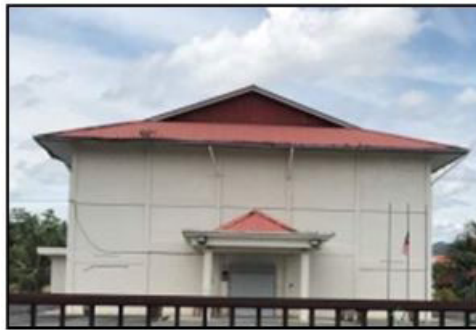
Figure 4: The Flood Evacuation Centre in FELDA

Usually, during flood disaster in FELDA areas, affected FELDA settlers will be transferred to a safe evacuation centre, for instance, schools, mosques or public halls (Mohamad, 2015). The flood relief centres are managed under the Regional Office of FELDA (Ismi, 2015; Berita Harian, 2015; Bernama, 2017). Figure 4 shows the example of FELDA hall as an evacuation centre during flood disaster.