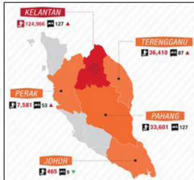
Figure 3: Map of flood disaster for FELDA Areas

Usually, during flood disaster in FELDA areas, affected FELDA settlers will be transferred to a safe evacuation centre, for instance, schools, mosques or public halls (Mohamad, 2015). The flood relief centres are managed under the Regional Office of FELDA (Ismi, 2015; Berita Harian, 2015; Bernama, 2017). Figure 4 shows the example of FELDA hall as an evacuation centre during flood disaster.