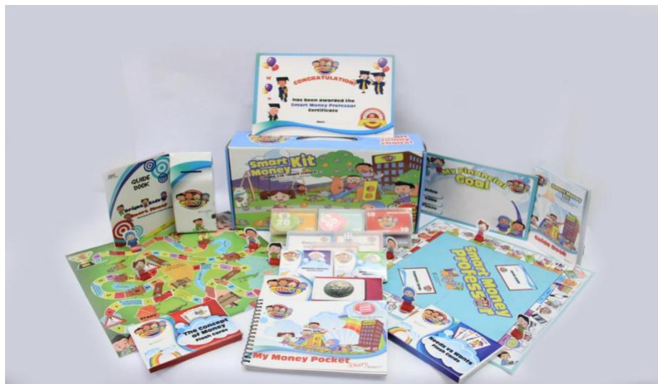
Figure 1: Smart Money Kit: Bright Kids Smart Money