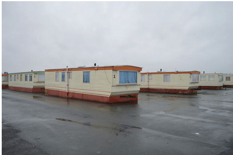
Figure 1: An image of Direct Provision accommodation at Lissywollen, Athlone, Ireland in 2013.