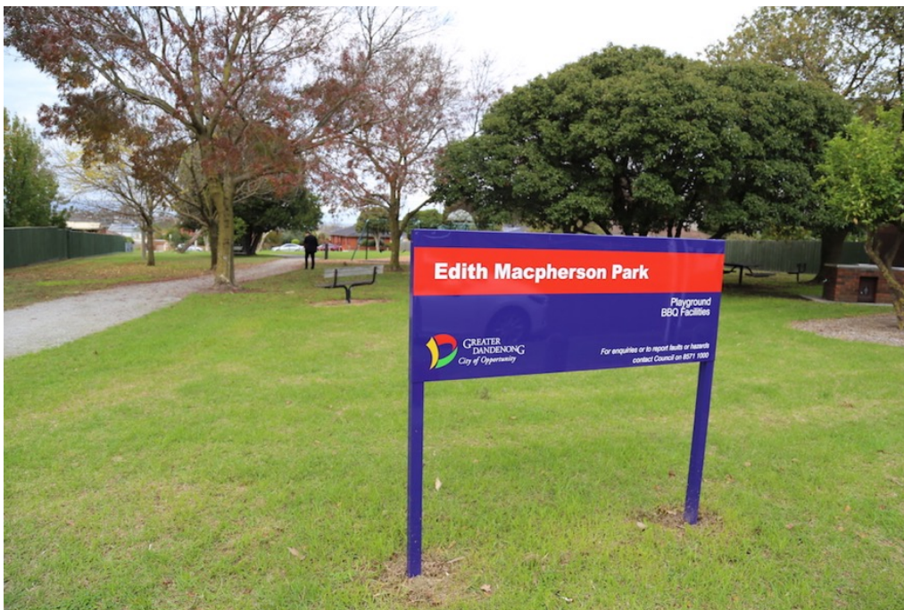
Image 1: Edith Macpherson Park (new signage installed in 2018).