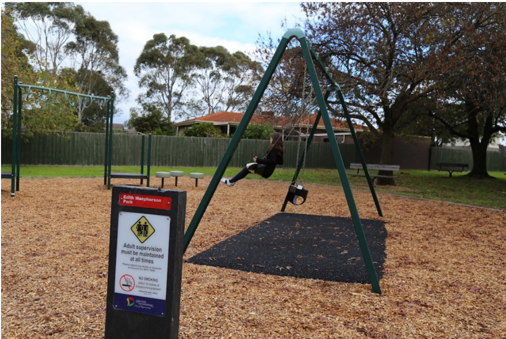
Image 2. The playground of Edith Macpherson Park is on the site of the original house.