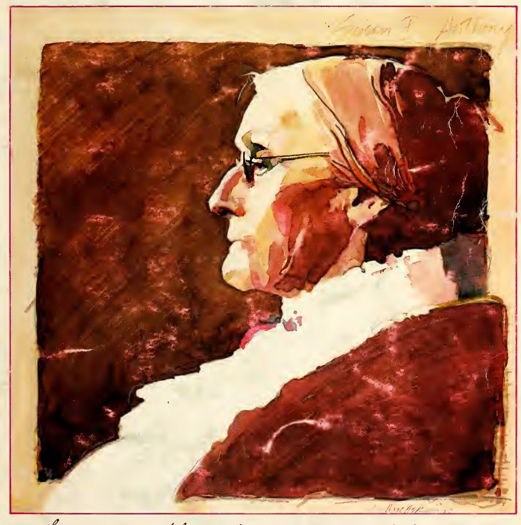
"he uniqueness of human life is represented by the ability of human beings to do something for the furt time... Civilization gets its basic energy not from its turbines but from its hopes." Norman Cousins