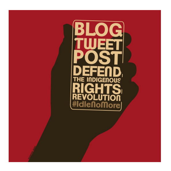
Figure 2: Idle No More Poster. Available: "Idle No More – A Living History," http://www.idlenomore.ca/living history.

teach-in at Station 20 in Saskatoon, Saskatchewan, and quickly the movement gained traction among indigenous and First Nations peoples in Canada. Using social media, specifically the #idlenomore hashtag, organizers planned and held grassroots rallies, flash mobs, marches, blockades and a National Day of Action on December 10, 2012.