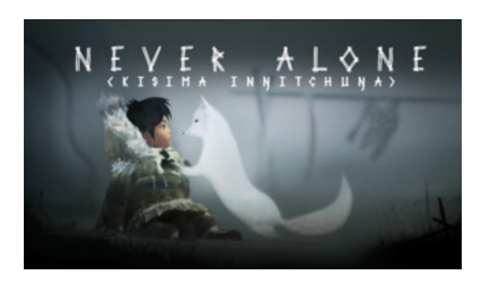
Figure 4: Cover Art of Never Alone video game, Available: "Never Alone," http://neveralonegame.com/.

Never Again is the first video game produced by Upper One Games and the first to be developed in partnership with indigenous peoples. Developers depended on a team of sixteen Iñupiat peoples as cultural ambassadors, stating that each group, "met extensively to ensure that all creative and business decisions were appropriately considered and supported the goals of all stakeholders." Extensive profiles of cultural ambassadors are included on Upper One Games website. But for developers, the process was more than just depending on indigenous storytelling. The Iñupiat community was insistent that the video game accurately represents this story and their peoples.<sup>70</sup>