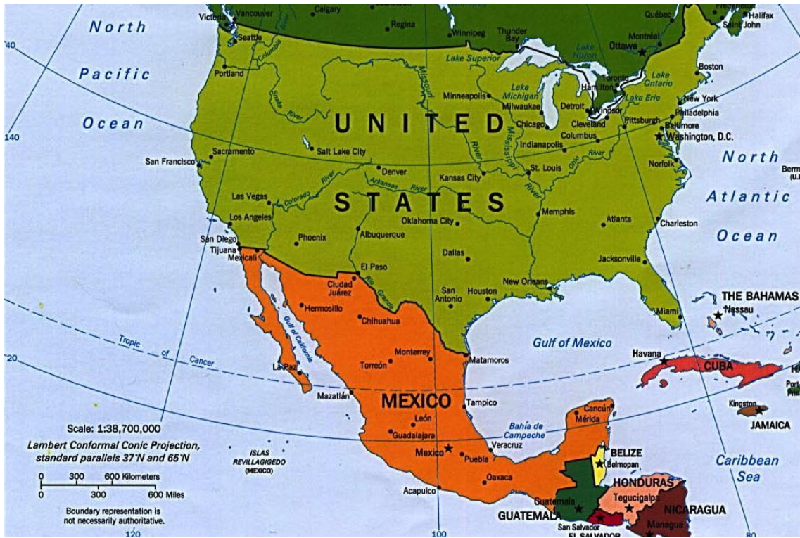
Figure 1: Map of North America