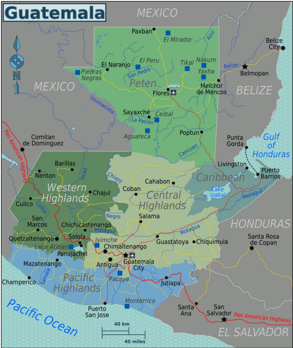
Figure 3: Guatemala Regions Map