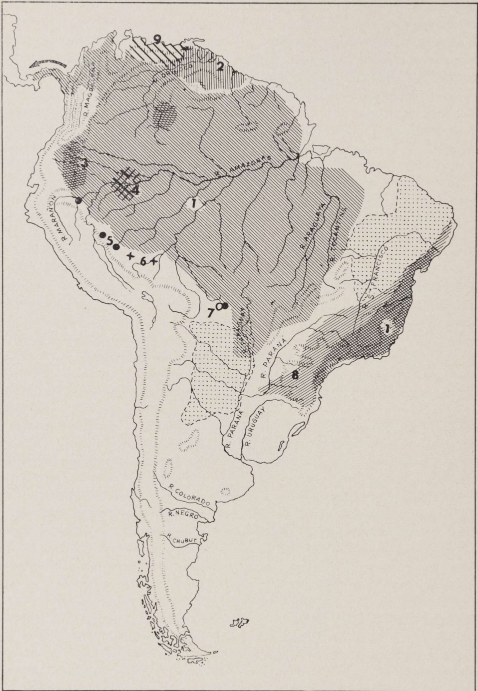
Fig. 5—Geographical distribution of the Bufo typhonius complex. (1) B. t. typhonius ; (2) B. t. alatus ; (3) B. ceratophrys ; (4) B. dapsilis ; (5) B. ockendeni ; (6) B. inca , B. leptoscelis , B. fissipis ; (7) B. quechua ; (8) B. crucifer ; (9) B. sternosignatus .