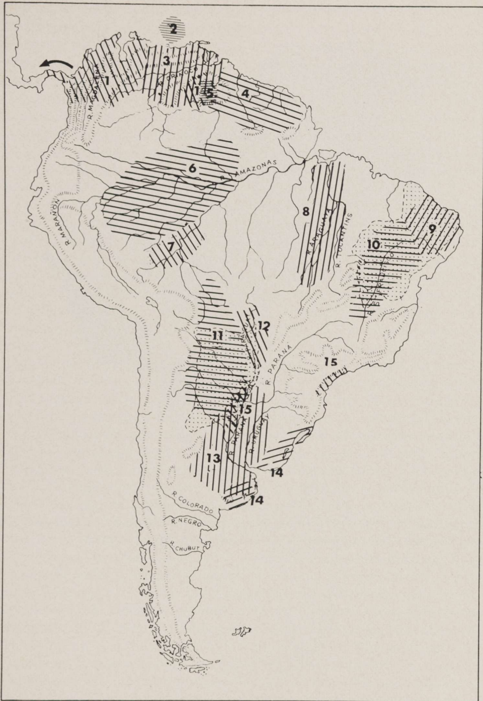
Fig. 4—Geographical fragmentation of the Bufo granulosis complex. The following forms have been checked: (1) B. humboldti ; (2) B. barbouri ; (3) B. beebei ; (4) B. merianae ; (5) B. natiereri ; (6) B. goeldi ; (7) B. minor ; (8) B. mirandariberoi ; (9) B. granulosis ; (10) B. lutzii ; (11) B. major ; (12) B. azarae ; (13) B. fernandezae ; (14) B. d'orbignyi ; (15) B. pygmaeus . (Note sympatry area along the Parana River).