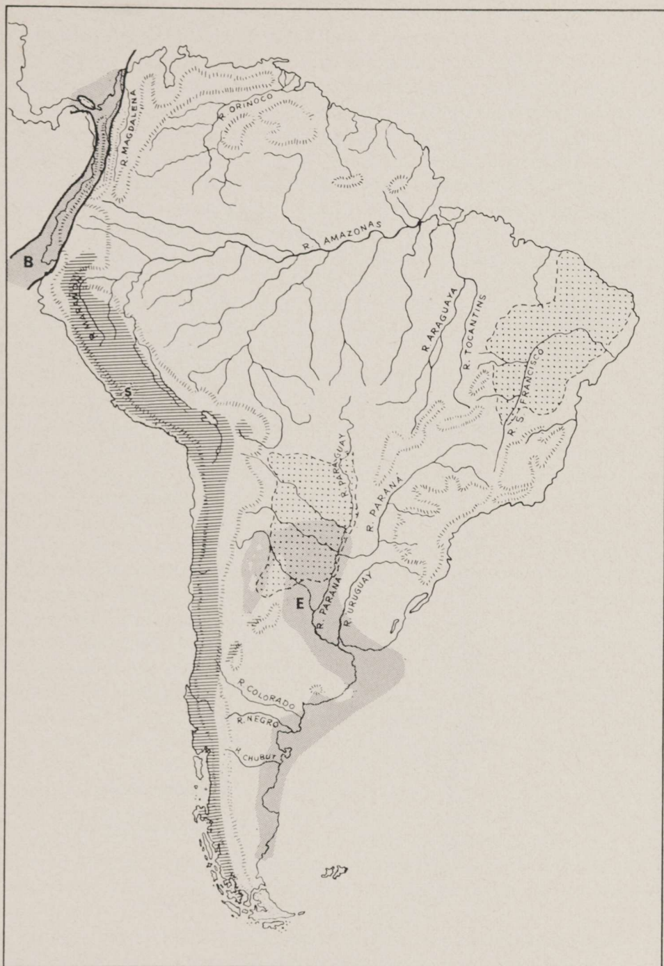
Fig. 1—Geographical distribution of the Bufo spinulosus group (s) in Andean South America. (B): channel of the Bolivar geosyncline (Eocene-Middle Miocene); (E) Entrerrian Mio-Pliocenic sea. (Dotted areas in this and following maps refer to xeric continental environments of the Chaco and Caatingas; San Francisco River).