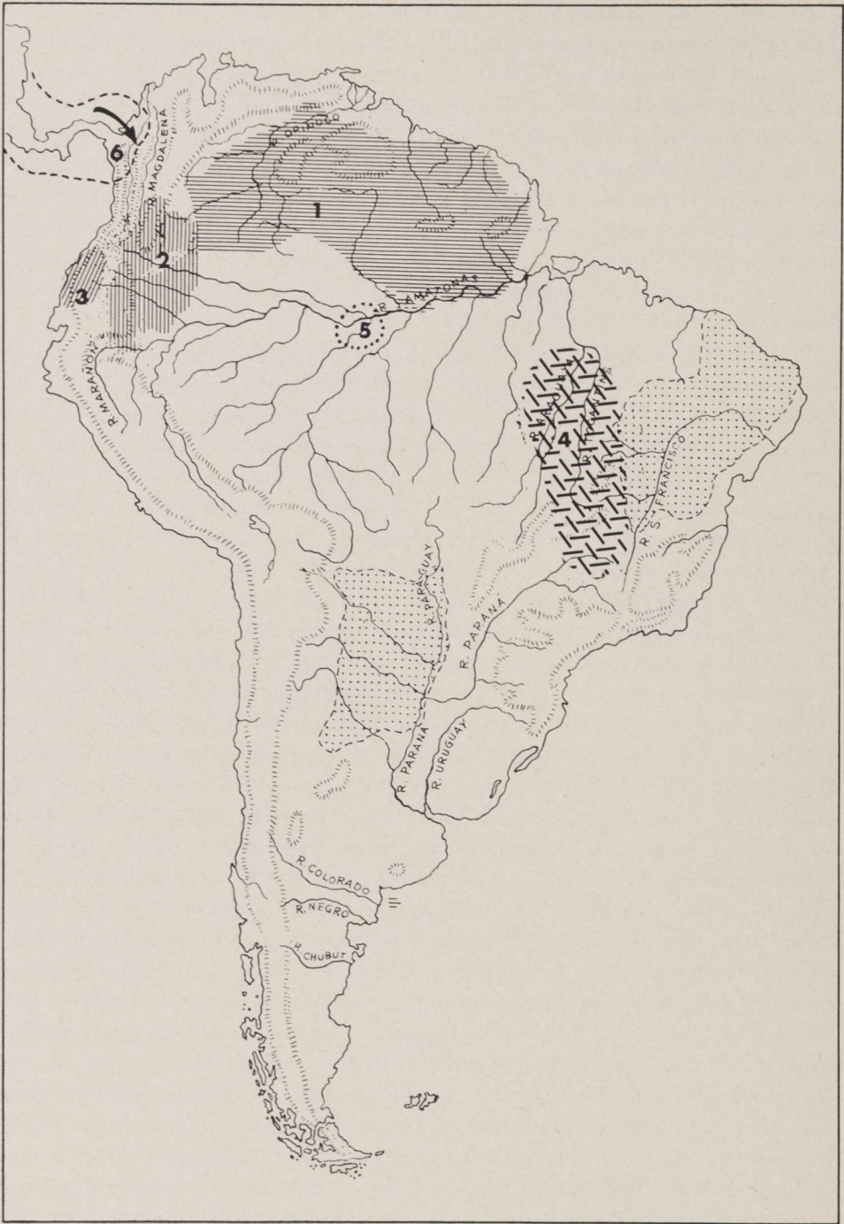
Fig. 6—Geographical distribution of the Amazonian Bufo guttatus group and of some uncertain or little known neotropical toads: (1) B. g. guttatus ; (2) B. g. glaberrimus ; (3) B. blombergi ; (4) B. ocellatus ; (5) B. manicorensis ; (6) B. haematiticus and B. coniferus . (Arrows indicate the two-way dispersal routes by the Tertiary isthmian link).