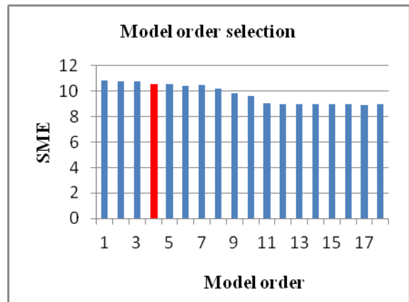
Fig. 1 Mean square error vs model order

The data were widowed between 12.30am and 9.00am at 30 minute interval making 18 data points. Moreover, Data for Wednesday 4th April 2102 was modeled using the AR Modeling technique and the best model order coefficients was selected by plotting the Mean Square Error (MSE) against the Model Order. The result obtained indicated Model order 4 is appropriate in this case (Fig.1). The model order was then used to predict the load consumption 30minute ahead, similarly the result showed that the predicted value signal was close to the actual (Fig. 2). The data correlates with the actual value when compared (Table 2)