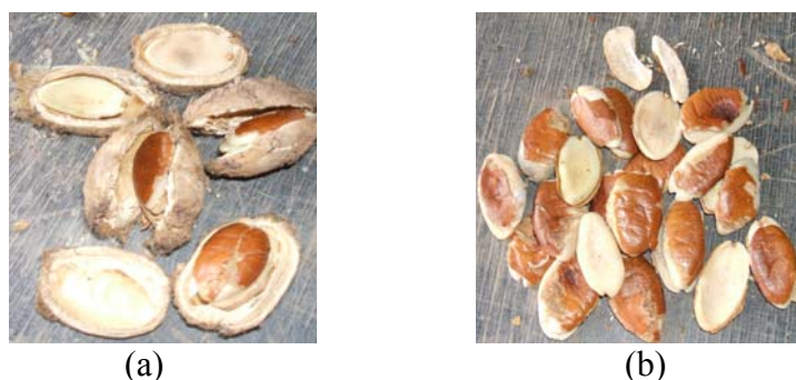
Figure 4. (a) Samples of cracked nuts during machine testing (b) Samples of dika kernels after separation from the shell.

The moisture content of the nuts at the time of the experiment was 6.6% (wet basis). It was observed that some of the kernels were audibly shaking inside the nutshell, indicating that the kernel had shrunk