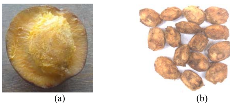
Figure 1. (a) A ripe dika fruit, partly exposed to show the soft fleshy pulp (Ogunsina et al. , 2008); (b) Samples of dika nuts

In a previous work (Ogunsina et al. , 2008) on the deformation and fracture of dika nut under uni-axial compressive loading, the nut evolved pronounced elastic deformation prior to a catastrophic brittle failure. The cracking force was lower when loaded along the transverse axis. Some samples of dika nuts are shown in Figure 1 (b). In comparison, roasted or steam boiled cashew nut, cooked walnut and conditioned balanites experienced lower deformation prior to nutshell fracture (Oloso and Clarke, 1993; Koyuncu, 2004 and Mamman et al. , 2005). Consequently, the proprietary nutcrackers (for palm nuts, cashew nuts bambara groundnuts) and existing patented devices (Ojolo and Ogunsina, 2007; US Patents 6786142 and 4843715) which are adequate for most nuts are not appropriate for dika nuts which have a stony shell. Also, existing palm nut crackers do not appear suitable for cracking dika nut because the nutshell is weaker than that of palm nut and the embedded kernel is more brittle than palm kernel (Koya and Faborode, 2005). This work was therefore undertaken to develop, test and evaluate a simple device for cracking dika nut more efficiently with a view to reducing the drudgery involved in manual cracking.