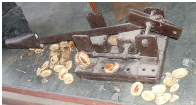
Figure 3. The table mounted experimental machine during testing

The experimental machine (Figure 3) was tested with 100 sun-dried dika nuts which were randomly selected from a lot obtained from a local market in Ile Ife, Nigeria. The moisture content of the nuts was determined by oven-drying at 130°C for 6 hours (ASAE, 2003). The sample was divided into three batches of 20 nuts each, to provide for replications. Each of the nuts was compressed along the transverse axis as suggested in a previous report (Ogunsina et al. , 2008). The actual deformation of the nut before it was cracked was measured as the change in the position of the slider. Based on the relationships reported earlier (Ogunsina et al. , 2008) energy utilized in cracking the nut was estimated, using the deformation.