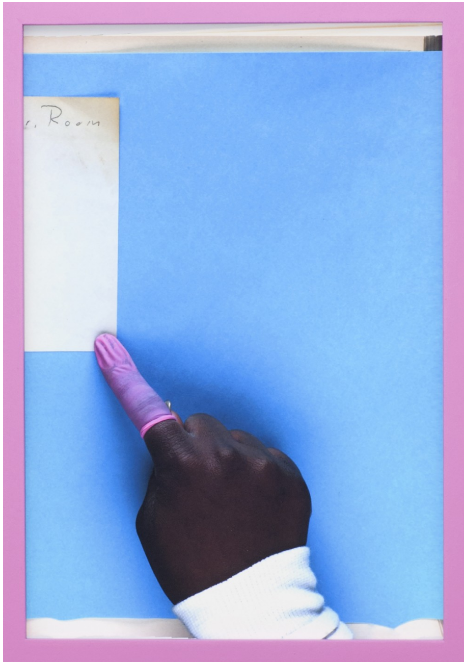
Fig. 3 The Inland Printer - 164 , from ScanOps , by Andrew Norman Wilson. 2012–ongoing. (Courtesy the artist; exh. Photographers' Gallery, London).

Eva and Franco Mattes's series of video installations Dark Content (2015) FIG. 4 consists of fascinating interviews with internet content moderators, their voices fittingly matched to stock avatars. Their stories, however, reveal that they are real people with their own ideas of what offensive material might be. Embedded in generic and corporate Ikea office furniture, the work is often most effective thanks to its dark comedy: one moderator recounts the removal of a SpongeBob SquarePants GIF that offended the CEO's dog. Brave viewers can access all of these censored videos via the dark web.