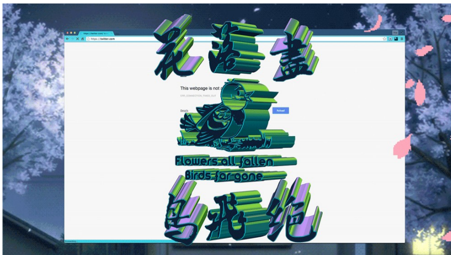
Fig. 5 LAN Love Poem.gif , by Miao Ying. 2014-15. Six monitors, looping

Miao Ying explores another form of censorship, that practiced by the Chinese government. A rising star of what might be called post-Chinternet art, Miao presents her work LAN Love Poem.gif FIG. 5, a visual mishmash of cheesy phrases in three-dimensional word art, cheap 8-bit internet backdrops and 'website unavailable' notices, across six monitors. Her work criticises a simplistic conception of the aesthetic capabilities of the Chinese internet, challenging the assumption that lack of access to 'western' websites can leave only an ugly wasteland. China's own IT companies Alibaba, Baidu and Taobao have developed their own hugely popular aesthetic, embedding sophisticated commerce and multi-platform functionality for millions of users, the downside, of course, being the government's ability to monitor these sites so effectively.