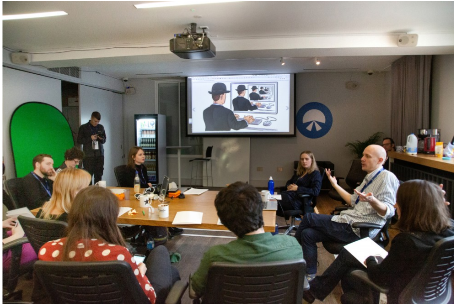
Fig. 7 Operation Earnest Voice , by Jonas Lund. 2018. Installation and performance (Courtesy the artist; exh. Photographers' Gallery, London).

The exhibition's curator, Katrina Sluis, and her colleagues have researched extensively and pulled together a sound set of artists, although in places the presentation is too cramped, diluting the impact of some of the stronger works. Exhibitions about the internet, videogames or indeed labour, should be more interactive than they currently are, as so often they relapse into conventional museum display methods. The theoretical questions asked of photography at the very start of the exhibition – the blurring boundaries of truth and fiction and of man and machine – are not adequately addressed, largely because they are too simplistic considering the ground covered by the exhibition. Conversation around the internet's dark habits now demands further nuance and must go beyond the language of machine versus human or an imagined endless circulation of images causing havoc. Indeed, most of the world and its inhabitants are now primarily documented or accessed through the interfaces of the internet, but the people and power structures behind the manipulation of images remain frustratingly familiar. And as for the title of the exhibition, a quote from the American President that suggests the internet is his sole basis of information and intelligence acquisition, well, Trump gets enough airtime as it is. 3