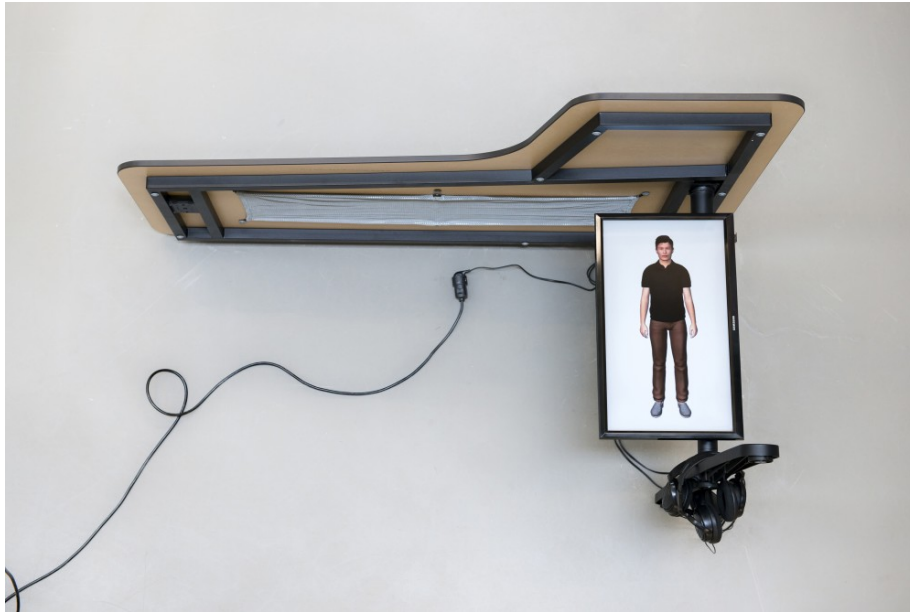
Fig. 4 Installation view of Dark Content , by Eva and Franco Mattes. 2016. Customised Ikea desks, monitors, videos, headphones, various cables (BAK, Utrecht; exh. Photographers' Gallery, London).

Miao Ying explores another form of censorship, that practiced by the Chinese government. A rising star of what might be called post-Chinternet art, Miao presents her work LAN Love Poem.gif FIG. 5, a visual mishmash of cheesy phrases in three-dimensional word art, cheap 8-bit internet backdrops and 'website unavailable' notices, across six monitors. Her work criticises a simplistic conception of the aesthetic capabilities of the Chinese internet, challenging the assumption that lack of access to 'western' websites can leave only an ugly wasteland. China's own IT companies Alibaba, Baidu and Taobao have developed their own hugely popular aesthetic, embedding sophisticated commerce and multi-platform functionality for millions of users, the downside, of course, being the government's ability to monitor these sites so effectively.