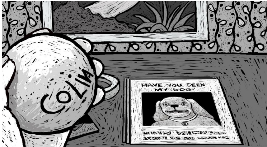
Master Missing Colin

returns. Yet there is no sense that Master is unkind or imprisoning his dog; rather that Colin stays out of affection. When Colin returns we see him and Master running towards each other and hugging – a simple gesture not only of affection but of each mirroring the other’s posture, as though the two were now equal.