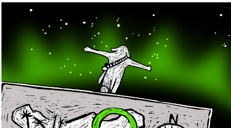
Colin's Dream of the Northern Lights

When that compass is lost, Colin uses starlight to find North; thus he begins to leave behind the constructed world of humans and interact with the natural world. When Colin eventually finds the Light he is then able to see; this is signified in the reciprocated green glow in his eyes. He sees his own life in perspective, his relationships...himself.