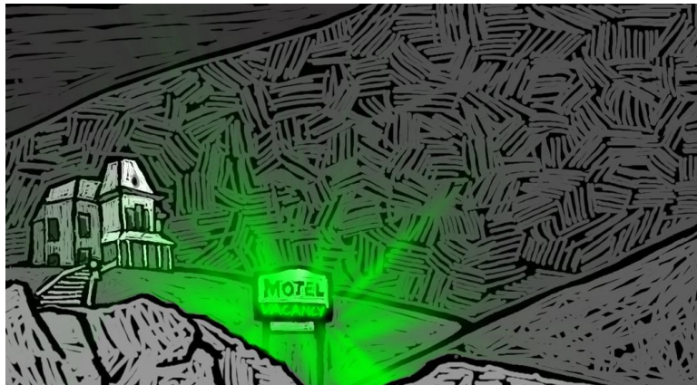
False Lights: the 'Bates Motel'

Colin's frustration at the contrast between the intensity of the vicarious experience, the spectacle offered by the mediated world and the dull grey looping of reality that forms the catalyst for his journey. Formally, this reality is represented through monotone, through repeated sequences and the device of Colin's sadly under-populated to-do list. This list in itself can be read as an attempt by Colin to lend significance to his activities, to his life. Muchinsky (2012) describes the act of filling, and subsequently crossing off and crumpling, a to-do list as a "demonstrative display of power and mastery over your environment". Colin's list at this point is an attempt to populate the infinite emptiness...and provide evidence of an authentically-lived life. By the end of his journey, his fuller life needs organisation. His new, longer list comes closer to Eco's view of the list as an attempt to grasp the incomprehensible and face infinity (Eco 2010)