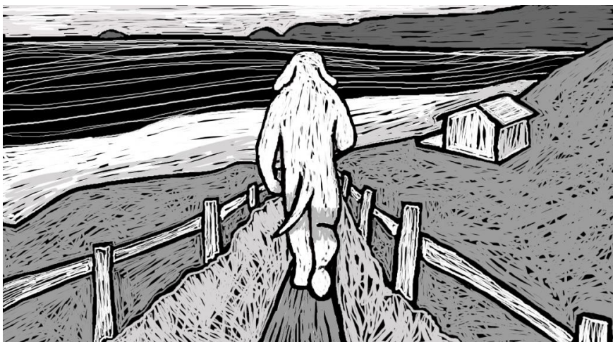
Setting out – the long walk

On the course of his journey Colin meets a Mentor, and a human helper; a star-gazer, representing a connection, an engagement with the natural world. He encounters several obstacles including false leads – following the conventional Rule of 3 in comic animation. But there are no ordeals or specific dangers for Colin, only the frustration and disappointment of false lights, the long walk and his own dogged determination.