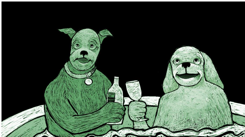
Colin and Jacky watching the lights

The hero, Colin, sets out on a journey of adventure and exploration, prompted by a visual, a media stimulus. He begins single-mindedly but without a specific plan as befits a dog, following the Northern Lights which act as a beacon, a guide towards some ill-defined excitement, beauty...joy. He travels North toward adventure, space, freedom and a search for an authentic, unmediated experience. As he moves further North he moves further from the comforting mediation of 'civilisation' but rather than any real danger he meets a very personal test of endurance and determination... and the kindness of strangers. Finally he meets Jacky, another human/dog and a reflection of his own self. His journey can be seen as a form of 'walkabout' – a solitary connection with the self, with the spiritual, and with one's own histories. We can imagine the stories – about the North, about their shared Dog and as-if-human natures - that Jacky told Colin, or that they dreamed together in the hottub.