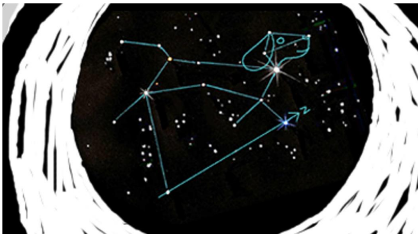
The dog star, reflected in the dog’s eye