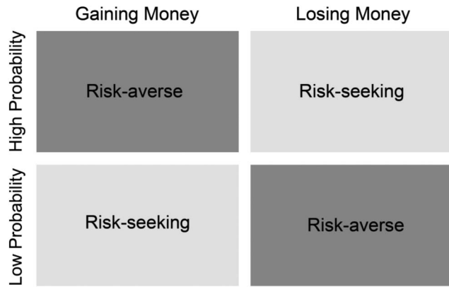
Figure 1. The fourfold pattern of risk preferences (probability range by domain of decision making).

probability loss and gain (e.g., Kusev et al., 2009; Tversky & Kahneman, 1992).