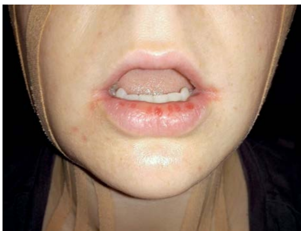
Figure 2: KTG application showing trismus 6 hours post-operative.