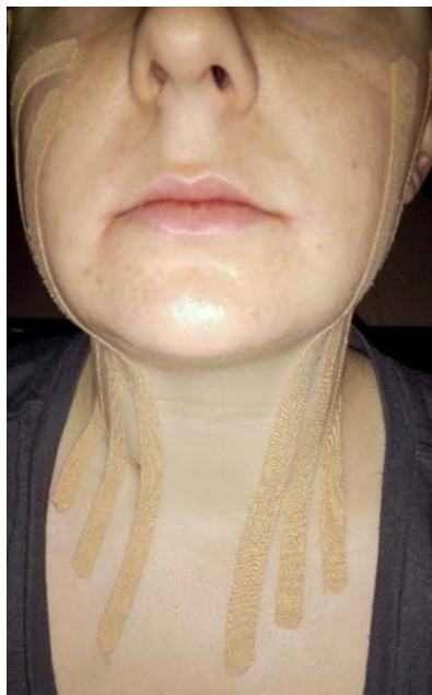
Figure 1: KTG application 6hours post-operative and facial oedema.