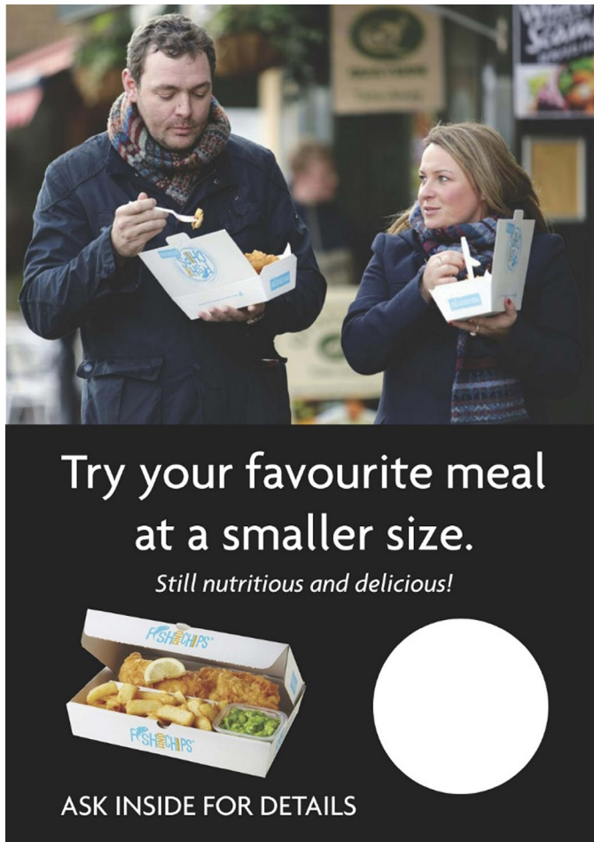
Figure 1 Promotional A0 size poster options.

attend along with a member of their staff. Owners or managers who did not respond were contacted through phone by HC.