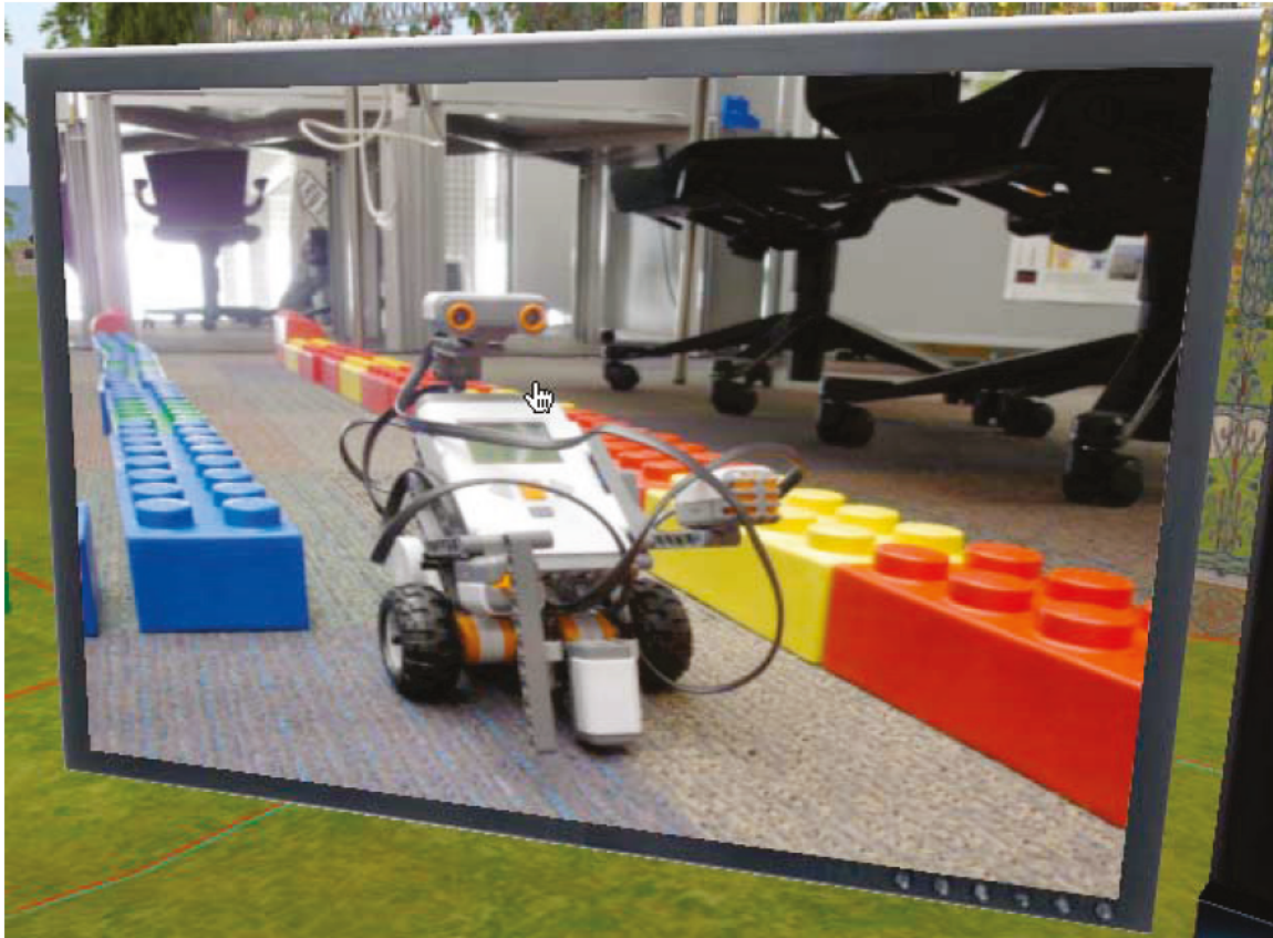
Figure 2. Robot design displayed within the Second Life experimental environment.

We used the Second Life interactive 3-D Internet environment to support inter-team communication and record ‘chat’ communication, using a private secure island leased from Linden Labs. Two video cameras were used to record intra-team communication for each of the teams. Additionally, a tailored Visual Basic program was employed to measure flow using Guo and Poole’s (2009) psychometric inventory. Flow, in this context, is defined as ‘a state of consciousness that is sometimes experienced by people who are deeply involved in an enjoyable activity’ (Pace, 2004). The flow scale measures three pre-conditions of flow (clarity of goal; fast, unambiguous feedback; and perceived balance of challenge and skill) and six dimensions of flow (concentration, perceived control, mergence of action and awareness, transformation of time, transcendence of self, and autotelic experience). The scale has good psychometric properties in terms of both convergent and discriminant validity and of reliability (Guo & Poole, 2009).