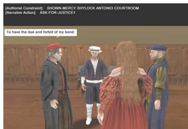
Figure 1. 3D virtual stage and characters from the Merchant of Venice Interactive Storytelling system: Shylock, Bassanio, Portia and Antonio .

described as the actions of a principal character. Our working hypothesis is that a given narrative action (such as a contract, a betrayal, a challenge, and so on ...) can be represented differently depending on the perspective of each character taking part in that action. In other words, a PoV consists of a character's representation defined from the perspective of the overall plot, not just of the character's role independent of any other. The PoV also implements the naive concept of a given character's standpoint on a set of events, although in an a priori rather than a posteriori fashion. This is achieved by defining different representations for the same narrative action depending on the PoV, which in turn requires, for instance, different sets of pre (resp. post) conditions. With such representations, narrative generation will adopt a given character's PoV for the selection of the actual narrative action, thus resulting in story variants according to the PoV. In addition, these variants will respond differently to real-time modifications of the narrative domains such as those introduced by user interaction.