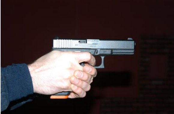
Figure 1 The hand grip.