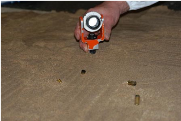
Figure 2 The optical target for the surveying was placed where the cartridge casings landed in the sand.