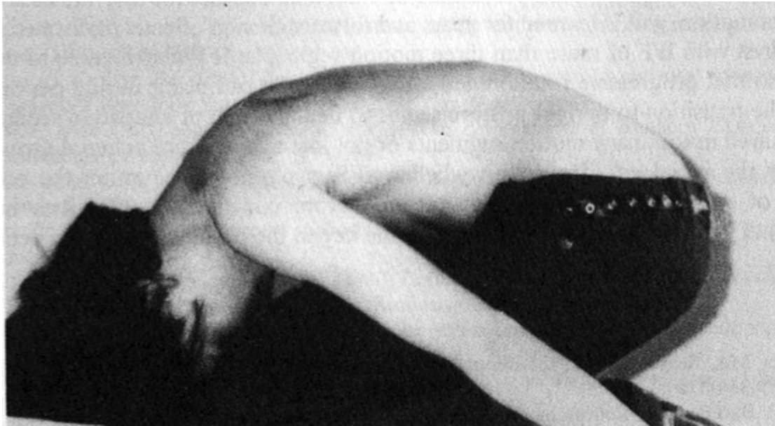
Fig. (1). Impaired Forward Flexion (adapted from [52]).

year-olds (7.9%) than in 4 and 5-year-olds (78.9% and 70.8%, respectively) and hypothesize that the reason for this is the transition from crawling to upright posture.