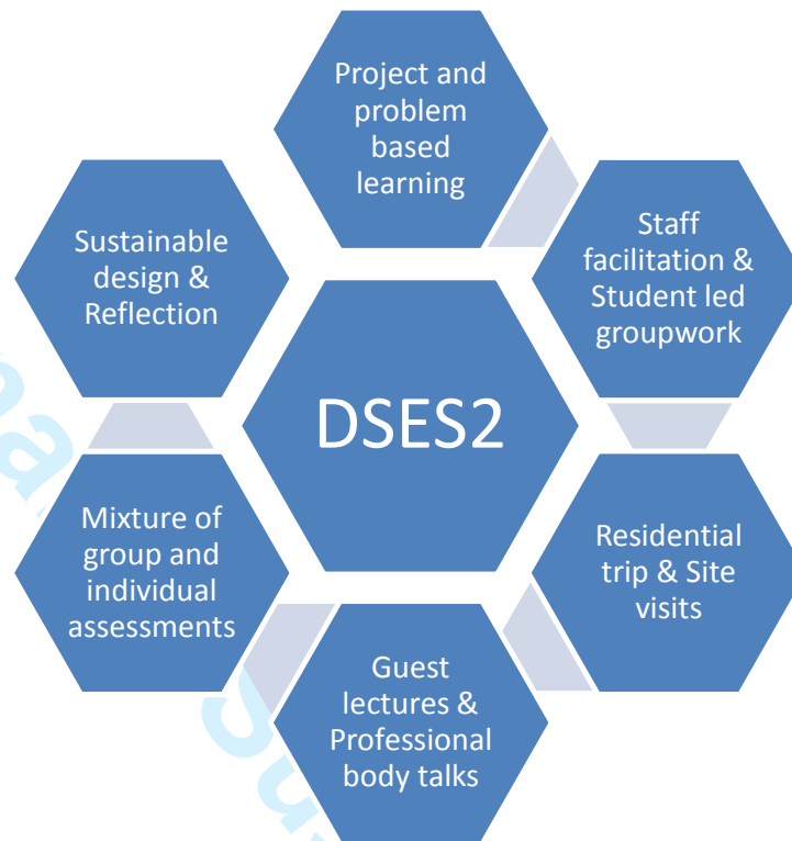
Figure 3.1: DSES 2 Teaching and Assessment Model.