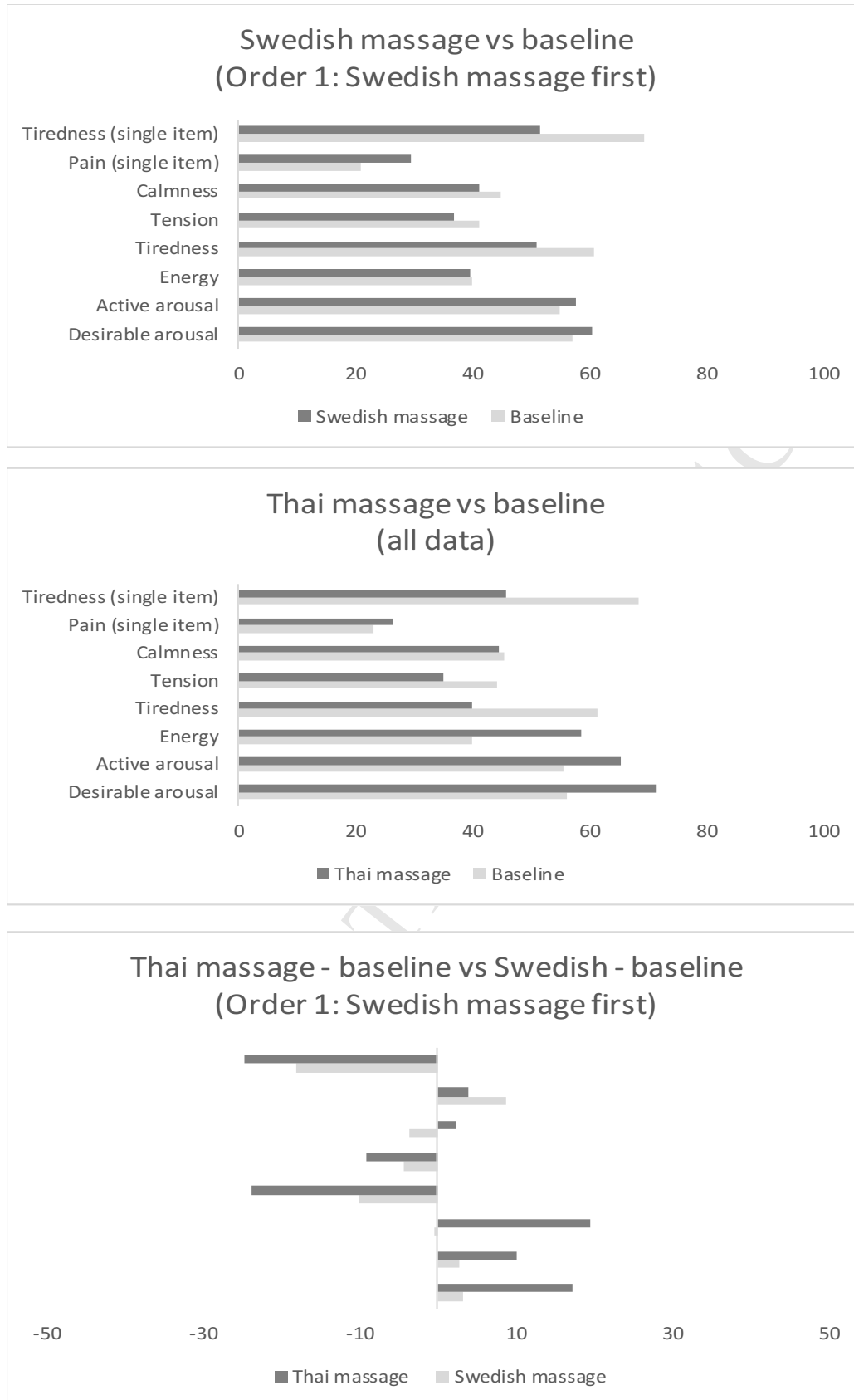
Figure 4. Comparisons of mean scores on outcome measures between conditions. All values are scaled as a percentage.