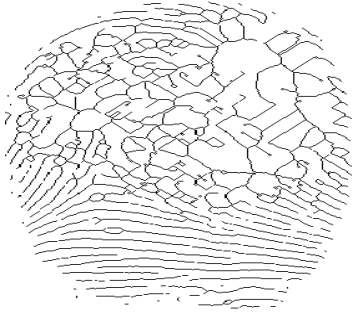
Fig.4. Preprocessed fingerprint image