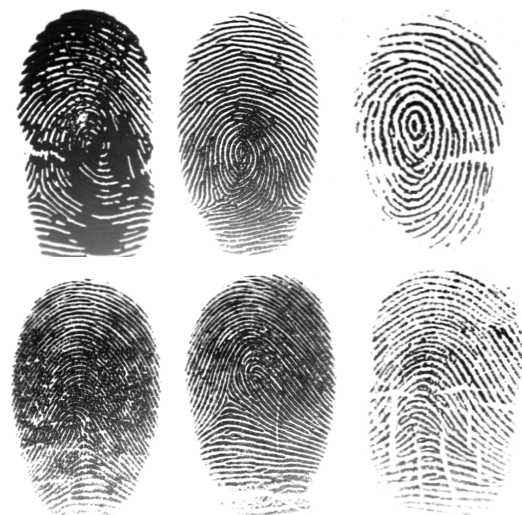
Fig.2: Fingerprint image samples

The input fingerprint images are obtained from FVC2004-DB1. The database contains 100 fingers and 8 impressions per finger. The size of each image is 640x480 pixels and its resolution is 500dpi (Maio, 2004). Sample of fingerprint images from the database is as shown in fig 2