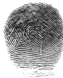
Fig 3. Input gray-level fingerprint image

The example of input gray-level fingerprint image to the proposed fingerprint verification algorithm is shown in fig3. Noise reduction and image enhancement are done and it is converted to binary image. Morphological operation is carried out on the binary image in order to thin the foreground pixels until they are one pixel wide. The output fingerprint image from the preprocessing algorithm is as shown in fig 4.