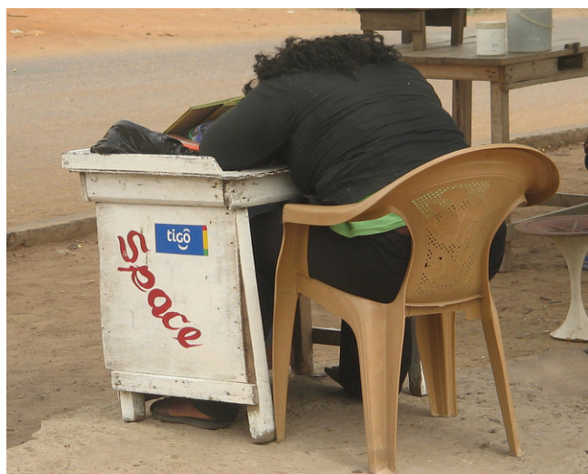
Slower activity.

Epidemiologist and PhD candidate at University of Edinburgh