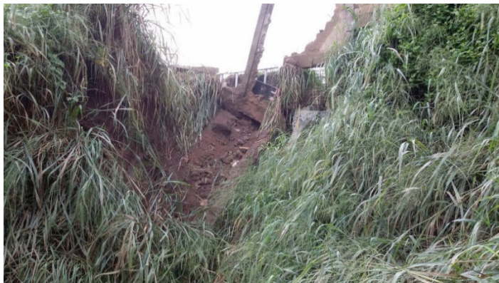
Figure 2: wastewater discharge from CU

None of the farms studied practiced wastewater re-use. Rather, all the wastewater was discharged into the environment. At CU community (which also owns the largest farm among the studied farms), about 874, 081 litres of wastewater was generated per day from its 10, 000 residents as at 2013 (Isiorho et al., 2014). The authors consider this a vast resource that can be harnessed to augment water demand on its farm which is situated less than two kilometers away from the wastewater treatment plant. Currently, the daily discharge of wastewater is released into a nearby stream. Some local farmers took advantage of this discharge by irrigating their vegetable farms, using the wastewater from CU.