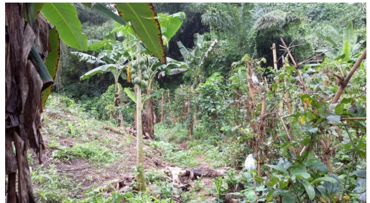
Figure 3: vegetable and fruit farm irrigated from CU wastewater