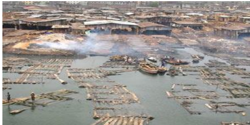
Plate II: An Aerial view of the market extension on water in Makoko