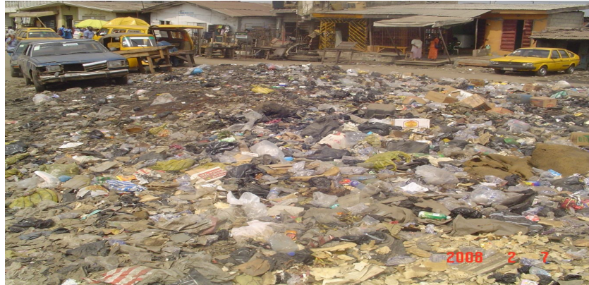
Plate I: Poor environmental condition in Makoko