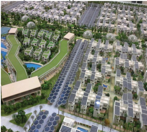
Fig. 6 Creating a Conducive Environment for Urban Population

The envisaged new cities of the world are to be human centered. They are to be ecologically friendly. They are totally integrated to ensure equal opportunity for participation and derivable benefits. Some of the new cities of the world being built are shown below. By creating sufficient spaces and greeneries around and within our built environment we give ourselves a chance of healthy living to take opportunities available.