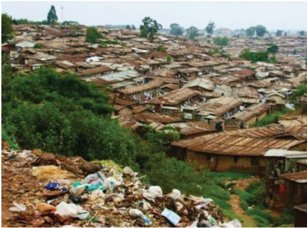
Fig.3. Slum Area of an Urban Center Devoid of Basic Amenities for Healthy Living

Slum-Clearance by a simple definition it is clearing up the mess initially created either through ignorance or under economic or social pressure. Whatever is the case it costs money, displeasure, and dissatisfaction, and represents backward step. This is contrary to rules of the game of sustainability. We give compensations to those displaced by slum-clearance which are hardly enough to make a start on anything acceptable or near current requirements. In the process what are doing is simply asking the displaced group of people move to new locations where subsequently they would be dislodged once again.