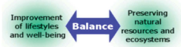
Fig. 1 Balanced Sustainable Development [3]

generations depend. In other words sustainability is a rolling investment that caters for now as well as later. It is a development that meets the needs of the present without compromising or jeopardizing the ability of future generation to meet their own needs. Obviously to create a balance between present which is committed to improvement of lifestyles and well-being and the preservation of natural resources and ecosystems for the future requires careful planning and organizing process. It is a process that cannot afford to continue to be arbitrary with issues concerning the destiny of a nation and people. Hitherto development programmes of a country like Nigeria, though may look attractive or achievable, have been on ad hoc basis and will amount to building on sandy soil or building castles in the air without first building up a comprehensive network of consequences of actions and reactions.