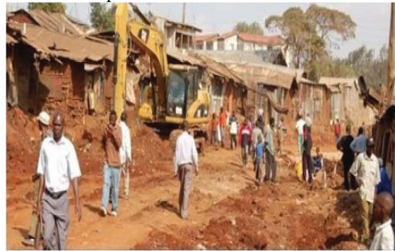
Fig. 4 Clearing the Slum at a Considerable Expense to Displace Members of Society

subsequently poverty to others who could not afford a new rental required.