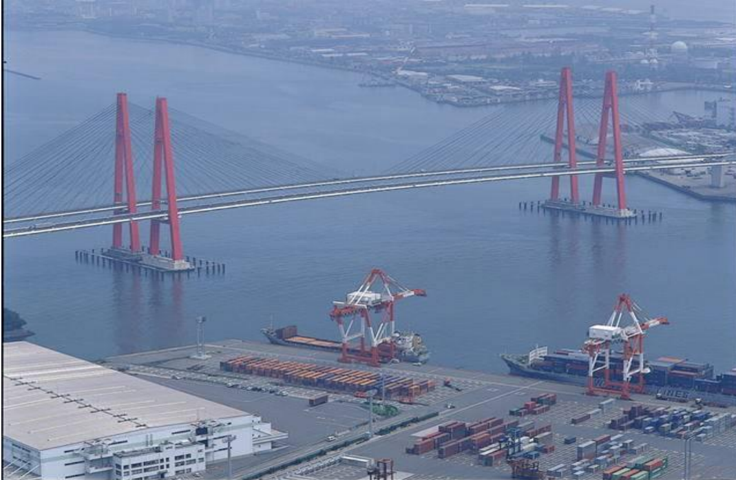
Figure 5: Visualized Lokoja, Niger and Lokoja Sea ports

environment professionals should put on their thinking caps to contribute to these emerging trends