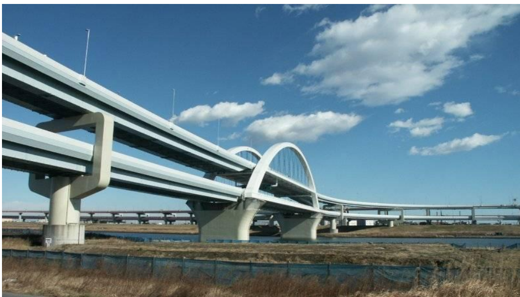
Figure 4: Visualized Third Mainland /Lokoja Bridge in 2020/25

The ongoing dredging of river Niger in Nigeria from the Atlantic Ocean to the Federal capital, Abuja, which is nearing completion, will open up a lot of the coastal towns and villages to development. Some of them will eventually evolve into mega cities as well.