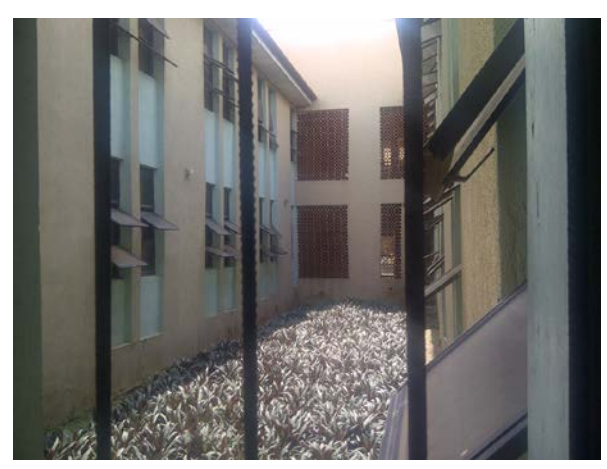
IJSER © 2014 http://www.ijser.org