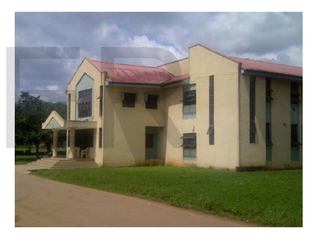
Fig. 1: View of the Camp House B (block 1) showing the physical condition of the building

The buildings were constructed with reinforced concrete post and beam structural system. Floors of the internal spaces were tiled with vitrified ceramic tiles at the entrance lobby, lobbies and wet area while the rooms were tiled with enamelled ceramic tiles. The windows are dark anodized aluminium projected windows while entrance doors are also glazed dark anodized aluminium double swing doors. The doors to the rooms are painted hardwood timber panel doors. Long span aluminium roofing sheets adorn the roof of the building. The external walls are rendered with cement/sand rendering and decorated with textured paints, other interior spaces such as lobbies and lounges were also decorated with textured paints. The room walls were however decorated with emulsion paints.