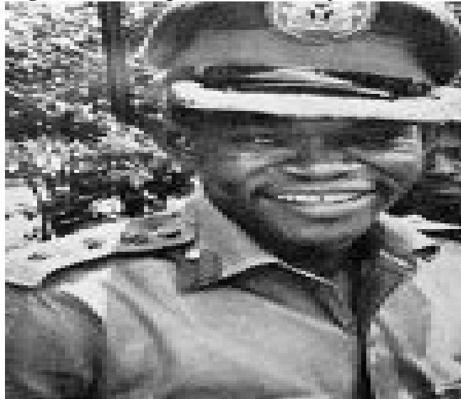
Figure 1: Late Brigadier-General Benjamin Adekunle