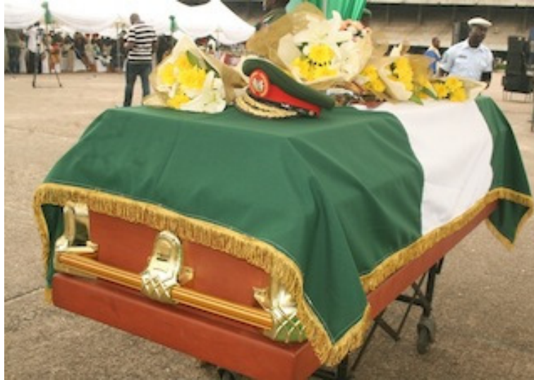
Figure 3: The casket of the Black Scorpion adorned with military paraphernalia

Remarkably and quite uncommon among elites, both military and civilian, in sub-Saharan Africa, The Black Scorpion , being a man of valour, died nobly, without having to cry out at the tail end of his life over his weak finances and failing health; never asking to be flown abroad at government expense. He stoically refused to blow off the roof (Owolabi, 2014:1)