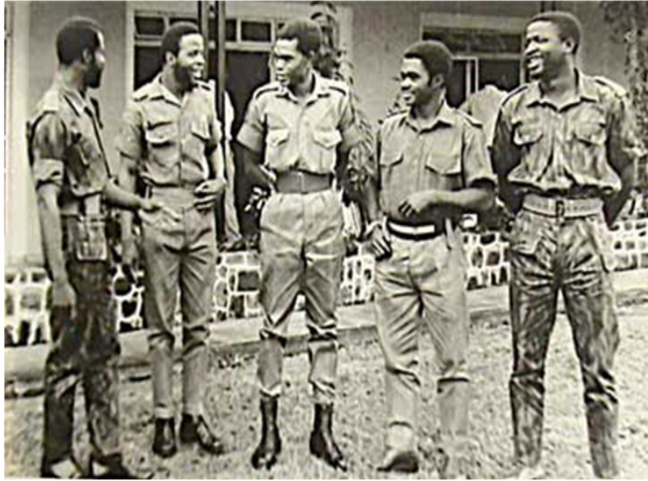
Figure 2: Benjamin Adekunle in the Middle of His Top Military Officers