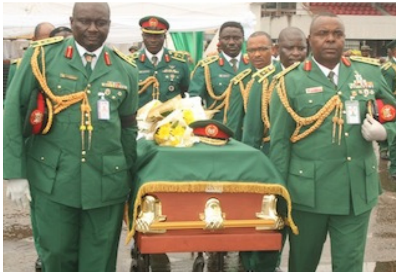
Figure 4: The casket of Late Black Scorpion during the lying in state