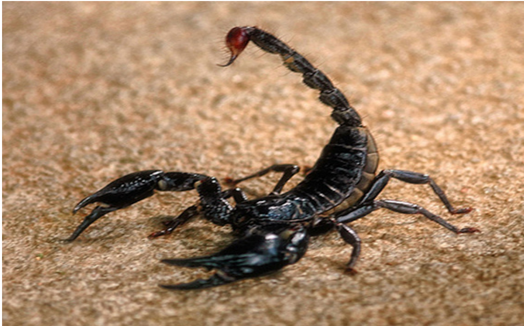
Figure 6: Black Scorpion: A name ascribed to Late General Benjamin Adekunle

This strategy made him a dreaded warrior that earned him the nickname “ The Black Scorpion ”