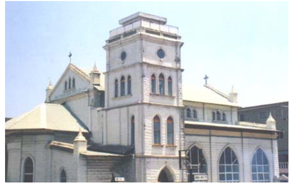
Plate 5.1.2: Holy Trinity Church, Ebute Ero, Lagos

Plate 5.1.1. 1Exterior view of the first building first constructed in 1897 but reconstructed in 1932 Holy Cross Catholic Cathedral, Catholic Mission Street, Tafawabalewa Square, Lagos Plate 5.1.2.Exterior view showing the tower and Gothic windows Holy Trinity Church, Ebute Ero, Lagos (1912-1929)