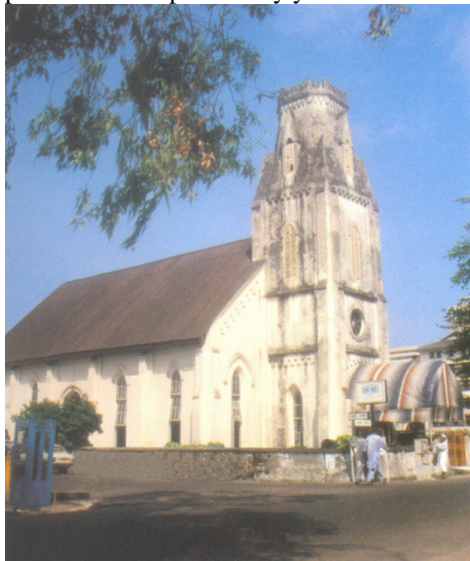
Plate 4.1.1. Exterior view showing the Gothic window and the tower

Before the completion of this building self-determination began to arise among the leadership of the Church which led to reverting from their adopted English names to the traditional names because Christianity was being closely linked to cultural imperialism of the Western world. After the dedication of the church building, there arose another dispute which led to a breakaway. The breakaway group pulled out of the church without referring the matter to the home Mission in America and held its first service under a temporary shed in a yard along Wesley Street, Lagos. Before the end of that week, a bamboo shed was put up in that yard and it became their place of worship for many years before another site was acquired for the construction of their own building.