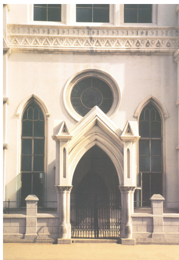
Plate 4.2.2 Entrance Porch

Although the design exhibited, to some extent, an eclecticism of many architectural traditions in Lagos at that time, the design reflected mainly the Gothic style which was the epochal vocabulary of ecclesiastical architecture in the Roman Empire during the Middle Ages (1100 – 1690AD). The architectural characteristics of this cathedral were not different from the old Gothic period which included the emphasis on strong vertical lines, high vaulted ceilings, minimal wall space, pointed window and door openings and buttressed walls. Airy and bright focus on verticality, pointed arches, rib vaults, buttresses, large stained glass windows, ornaments and pinnacles gave a fulfilling symbol to the religious aspiration of the building. This Cathedral Church of Christ pioneered a careful attention to symbolic ecclesiastical architecture in Nigeria during the British rule.