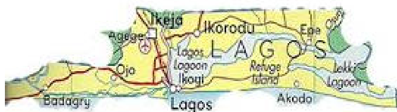
Plate 2.2 Map of Lagos State

https://www.google.com.ng/search?q=map+of+lago+nigeria&newwindow=1&tbm=isch&tbo=u&source=univ&sa=X&ei=oHIWU9vRKsyI7AaPkYGyCQ