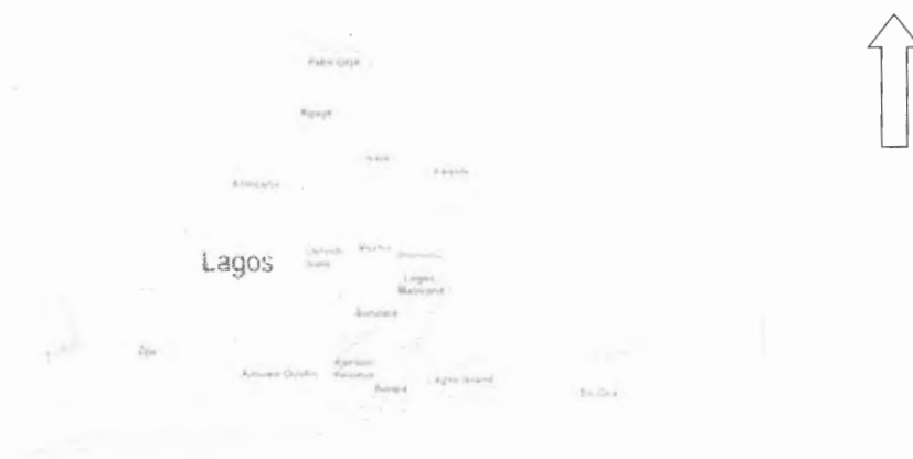
Figure 1: Map of Metropolitan Lagos.

Representing 0.4% of Nigeria's territorial landmass (Esubiyi, 1994), Lagos is located on a total landed area of 3,345 sq km (1,292 sq mi) on four principal islands and adjacent parts of the state's mainland, the islands are connected to each other and to the mainland by bridges and landfills. Major sections of the old city include Ebute-Metta, Yaba, Surulere, and Somolu, which now serve as the commercial district, on western Lagos Island; Ikoyi Island, situated just east of Lagos Island and joined to it by a landfill; Apapa, the chief port district, located on the mainland; residential Victoria Island; and industrialized Iddo Island. Importantly, mainland suburbs which formerly were part of the old western region were incorporated as part of the city in 1967. These areas included Agege, Ikeja, Alimosho, Alakuko etc (Microsoft Encarta, 2008).