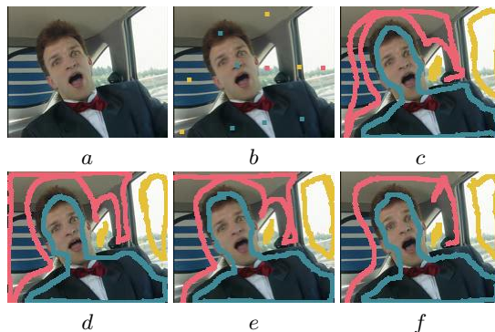
Fig. 2. Markers on sequence carphone (a) frame 7 of extract from carphone sequence, b) few points on frame 7, c) heavy markers on frame 7, def) heavy markers on frame 3,7 and 10)

to show how our method benefits from such algorithm and what it offers compared to a direct processing of Seeded Region Growing. In this perspective, we used three different settings of markers (Fig. 2). The results of these experiments are presented in Tab. 1. We denote here by precision the average spatial distance (in pixels) between the frontiers of the resulting segmentation and those of the reference segmentation. We used two sets of parameters (\alpha, \omega) for (P_1, \dots, P_n) -CC to show that our method is robust to parameter settings (which have besides not been optimized). Let us observe that, whatever the markers used, our method always provides better results than the other two approaches. However, like the other two interactive methods, the interactive QFZ segmentation is very sensitive to the markers given by the user.